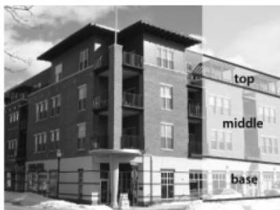
Figure D7: Building Articulation