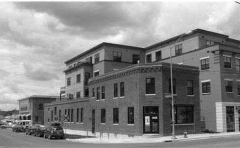
Figure D4: Variation in Roof Lines

No blank walls shall be permitted to face the public street, sidewalks, or other public spaces such as plazas. Elements such as windows, doors, columns, changes in material, and similar details shall be used to add visual interest.