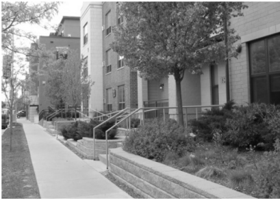
Figure D8: Ground Floor Residential Uses