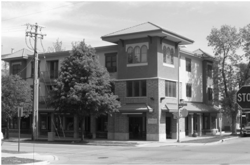
Figure D1: Entrance Orientation