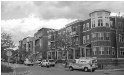
Figure D6: Building Alignment