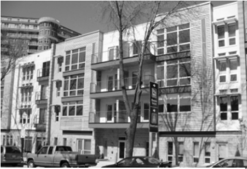
Figure D3: Facade Modulation