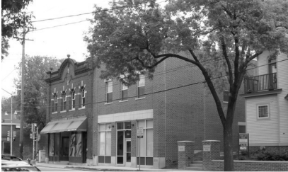
Figure D5: Compatibility with Traditional Buildings

F - Shall be used in limited quantities as an accent material.