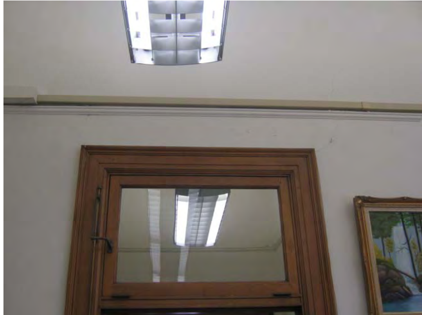
Plaster Cracking at Corners of Third Floor Door

Plaster cracking was observed at the upper corners of multiple doors on third floor. This is to be expected given the age of the building and the flexible nature of the steel beam support girders.