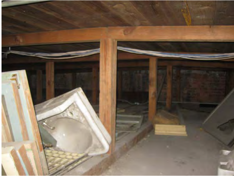
Underside of Pitched Wood Roof Framing

At the high roof and low roof on second floor, there is a pitched wood post and beam roof system built-up on top of the existing concrete slab.