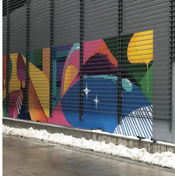
Wilson Street garage entrance under construction Mural along the west side of the Garage