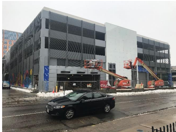
View of the Garage entrance/Podium from Wilson St