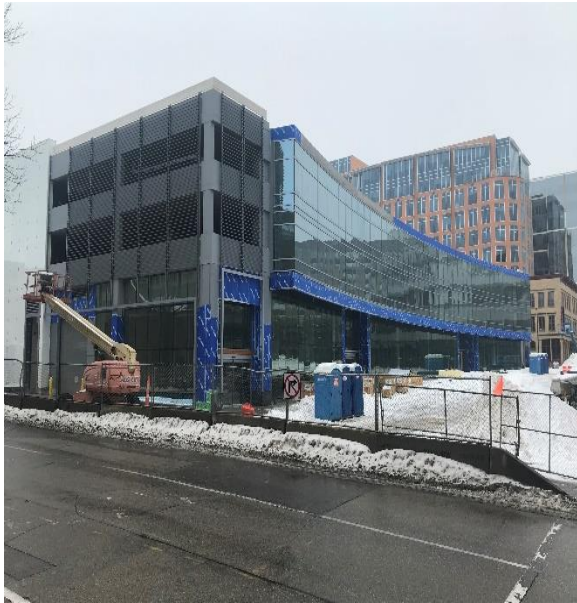
View of Podium looking up Pinckney Street