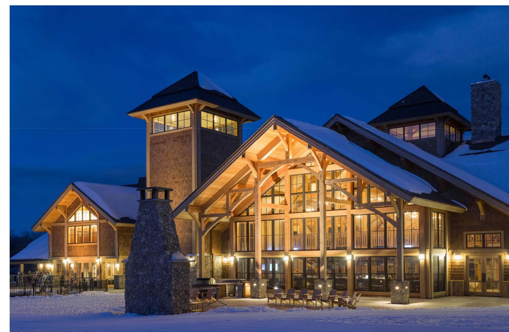
Style - Image 2

Concept Elevation & Images 1000 Oaks Lots 2 & 3 Madison, WI June 29, 2016