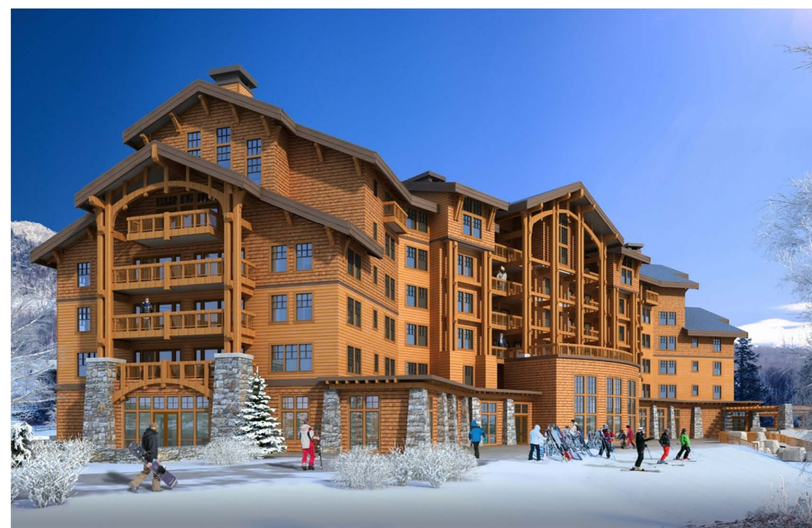
Style - Image 1