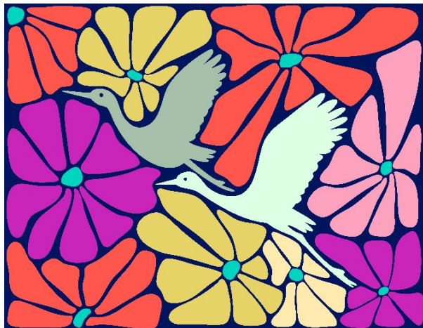
Alternate design 2: