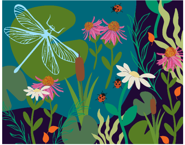
Alternate design 1: