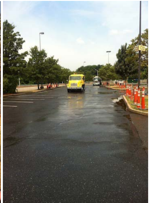
FINISH LINE- AFTER