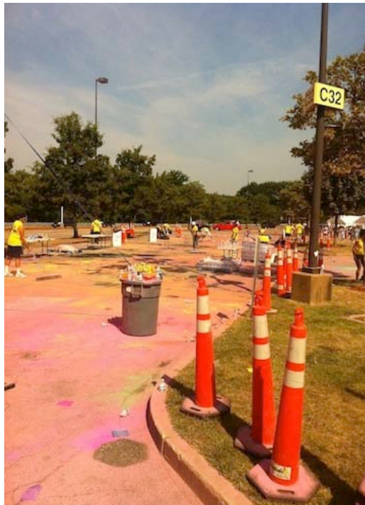
FINISH LINE- BEFORE

Clean up process is as follows. Immediately following the event, volunteers and staff will sweep the bulk of the color. Next, at least 2 street sweepers come in to do a dry sweep of the color. Then high-pressure water will be used to lift the remaining color and the street sweeper will then vacuum the water and color that is left.