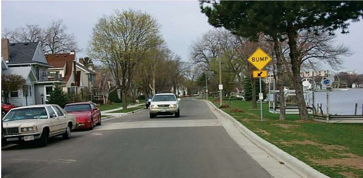
Typical Speed Hump