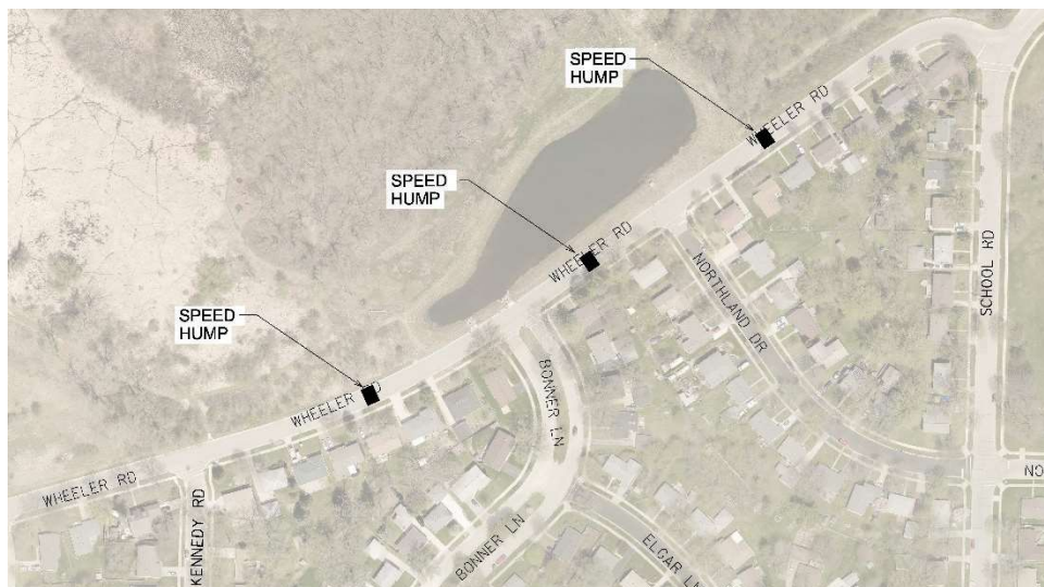
Proposed Speed Hump Locations

Speed humps are our most effective speed control devices and can help maintain the residential nature of a neighborhood. The preliminary design incorporates speed humps, as shown below. The indicated locations and number of speed humps are approximate and may be revised based on the comments from this survey. Speed humps are also being proposed to the residents between School Road and Delaware Boulevard, and a series of islands are being proposed between Comanche Way and Sherman Avenue. However, this survey only concerns the speed humps between Kennedy Road and School Road, as shown below.