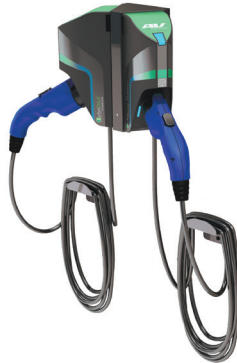
TurboDock Dual Wall Mount