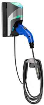
TurboDock Single Wall Mount