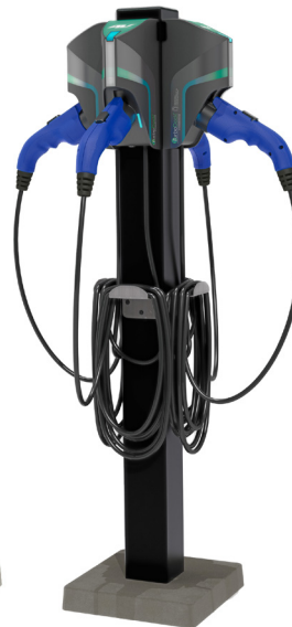
TurboDock Quad Pedestal Mount