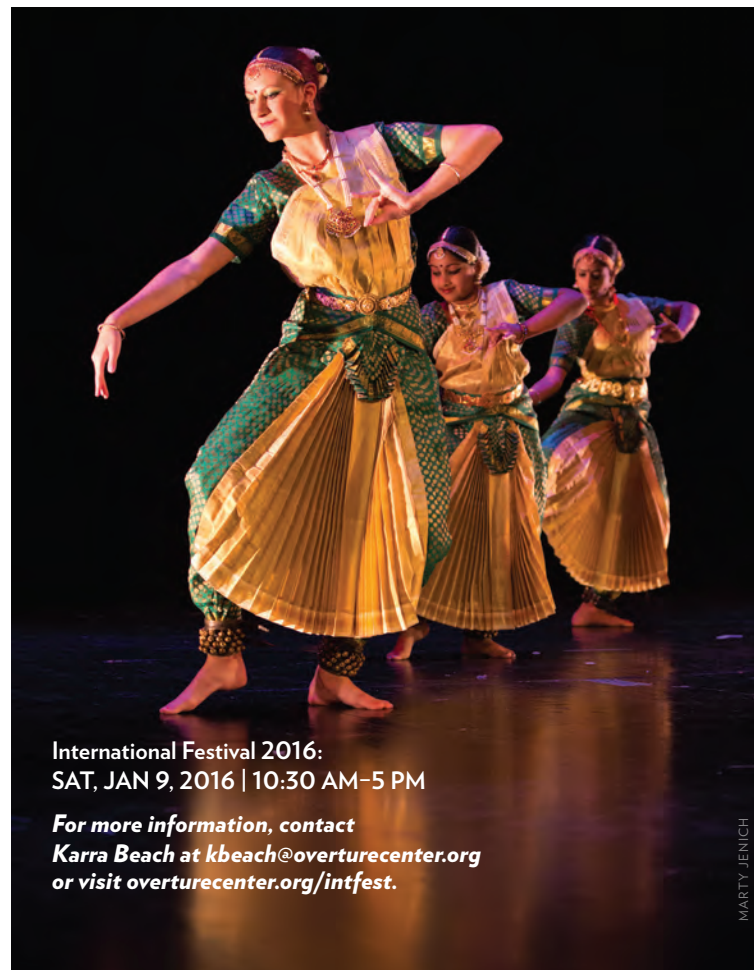
International Festival 2016: SAT, JAN 9, 2016 | 10:30 AM-5 PM