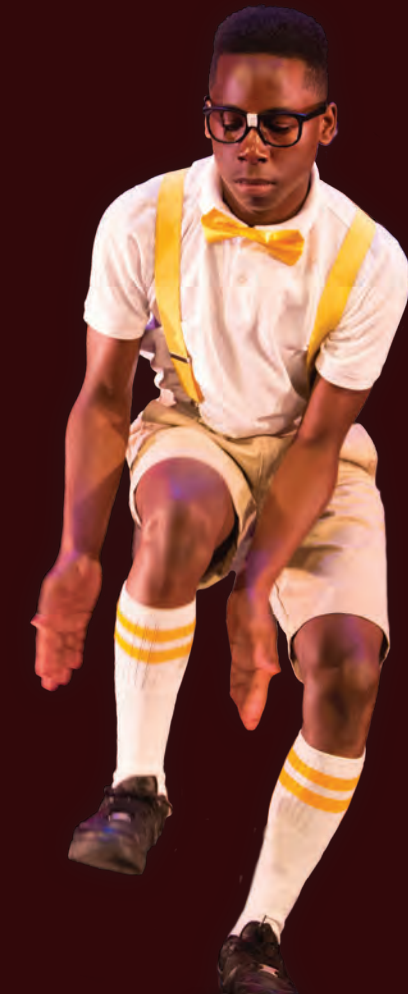
X-CLUSIVE Movement

Learn more and register at overturecenter.org/RisingStars