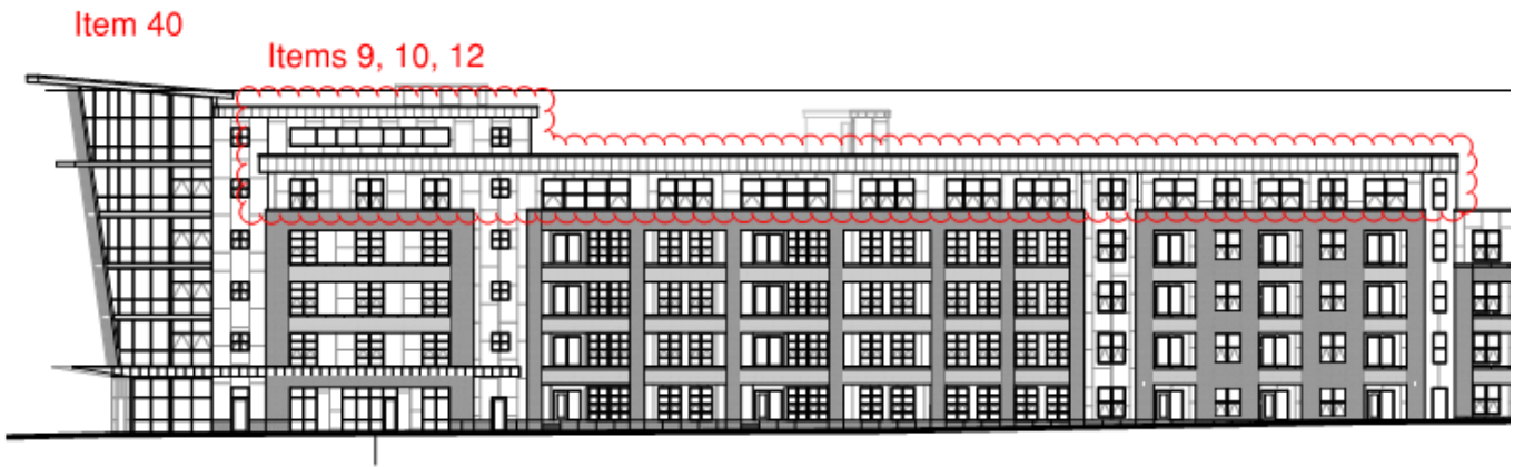
Fish Hatchery St. Elevation