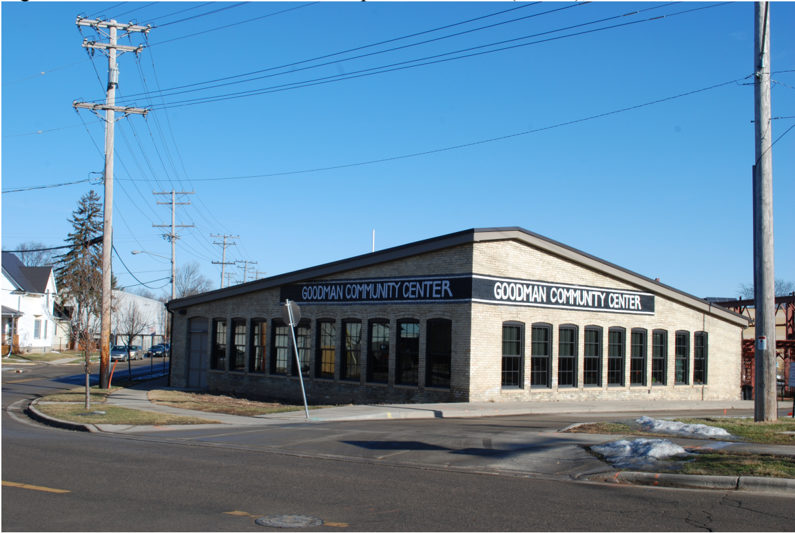
Figure 6. Madison Brass Works, 1927, Showing Original Front Façade