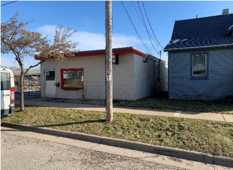
These 2 pictures show 1521 to the left and 1525 to the right. Remaining pictures are all 1525