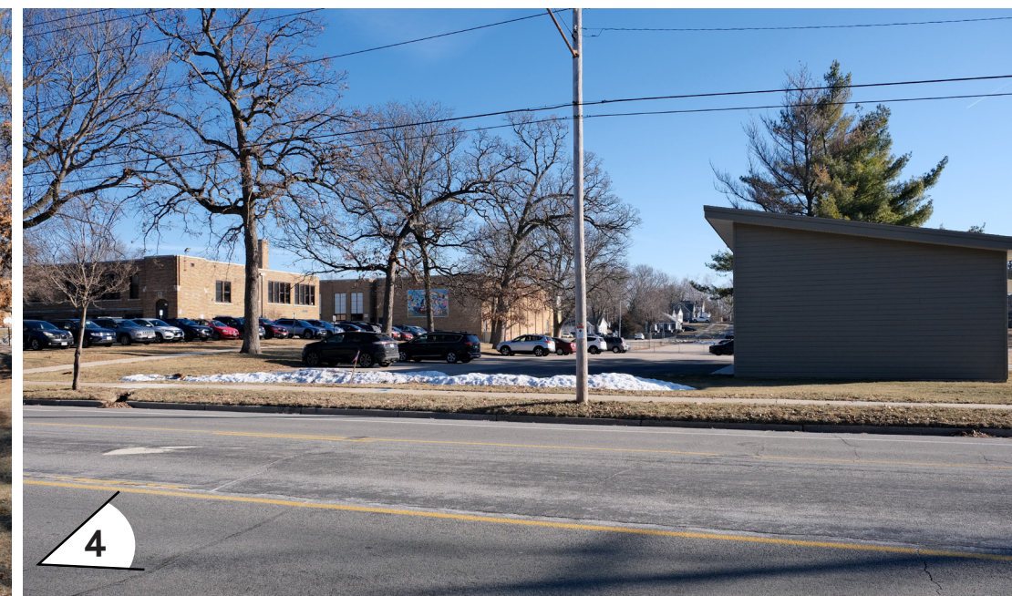
View East from Sherman Ave