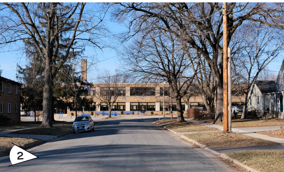
View West from Northwestern Ave