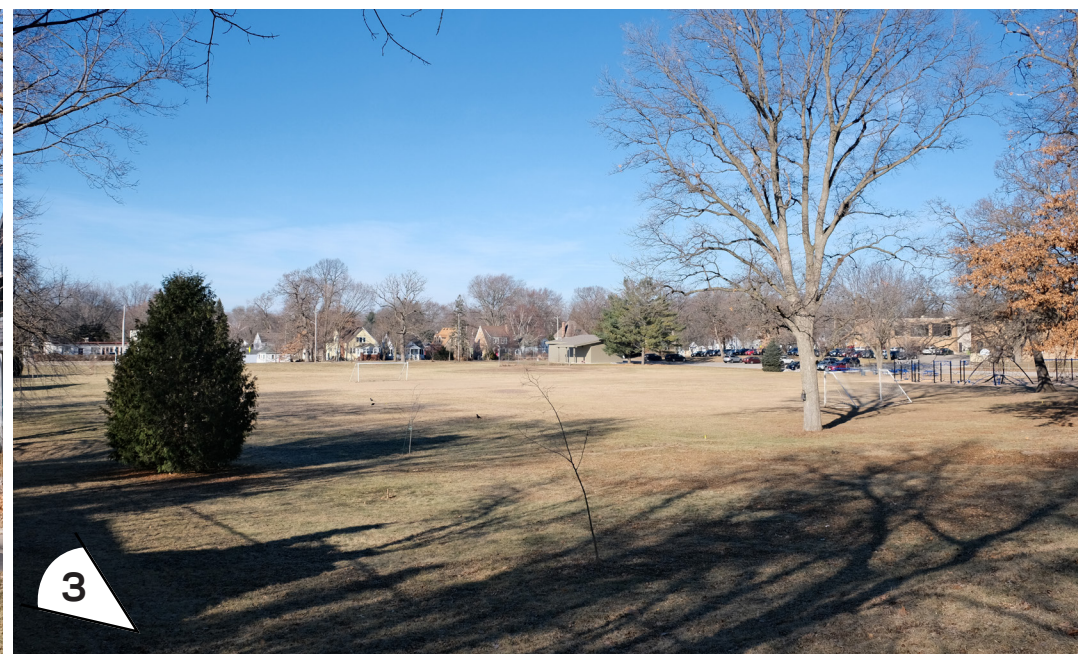
View Northwest from Ruskin St/Kropf Ave intersection