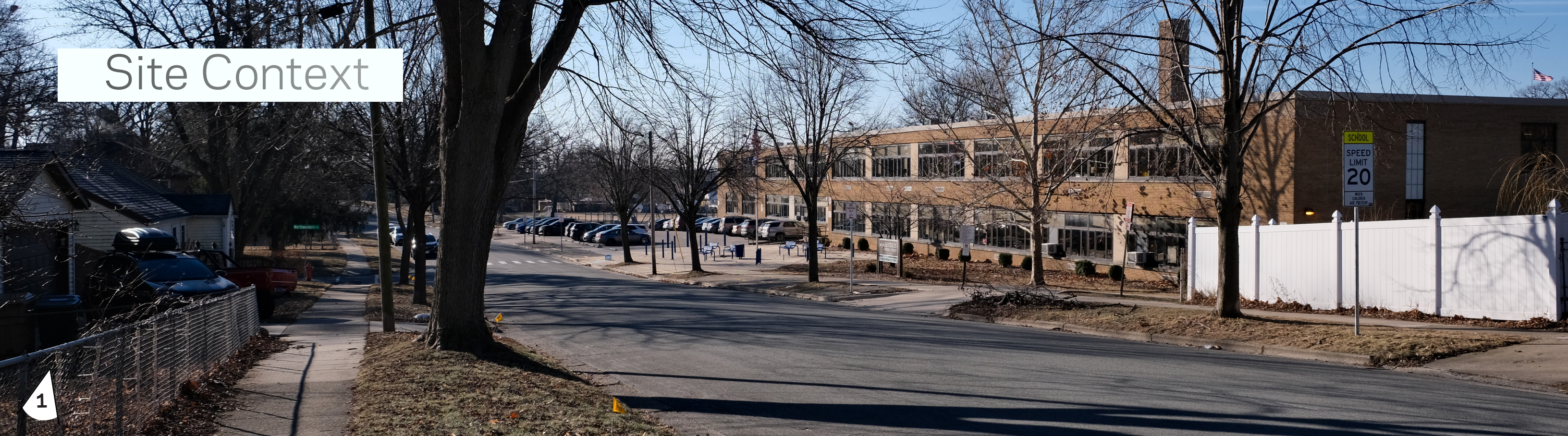
View South from Ruskin St