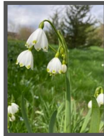
Snowflake Leucojum sp