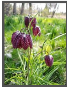
Checkered Fritillary Fritillaria meleagris