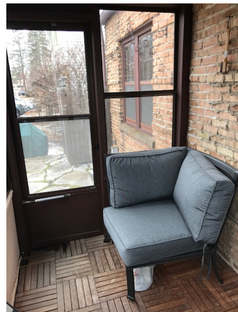
TINY ENCLOSED PORCH & CHIMNEY TO BE REMOVED