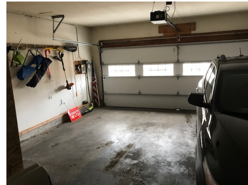
steps up form garage to house is challenging for everyday living