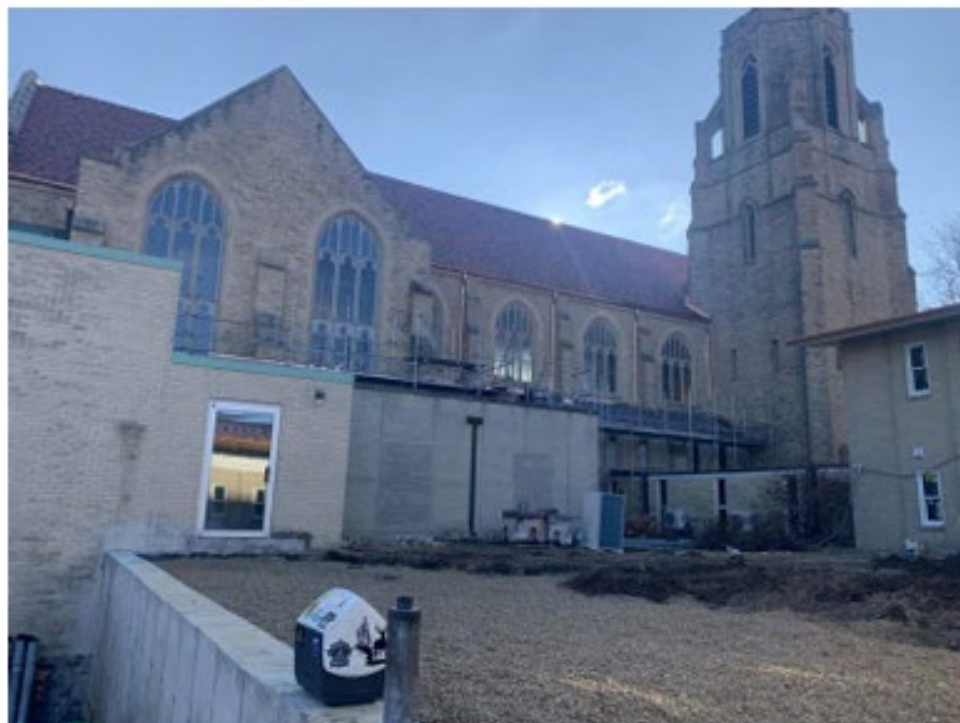
COURTYARD LOOKING EAST