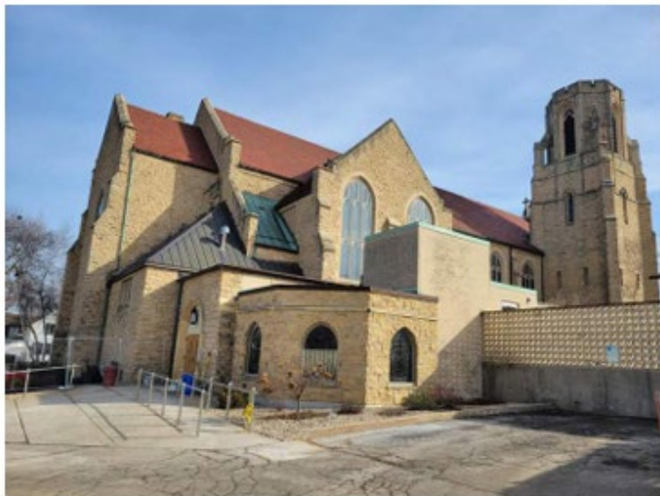
NORTH PARKING LOT LOOKING SOUTHEAST