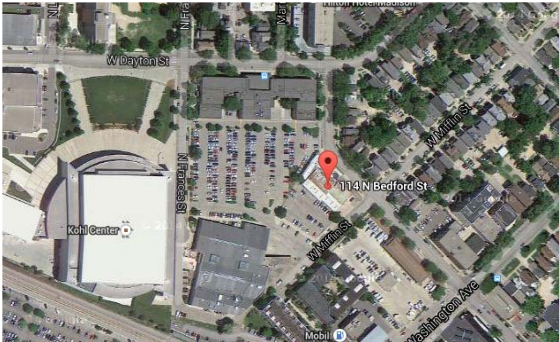
Google aerial view

Industrial building. Date of construction unknown.