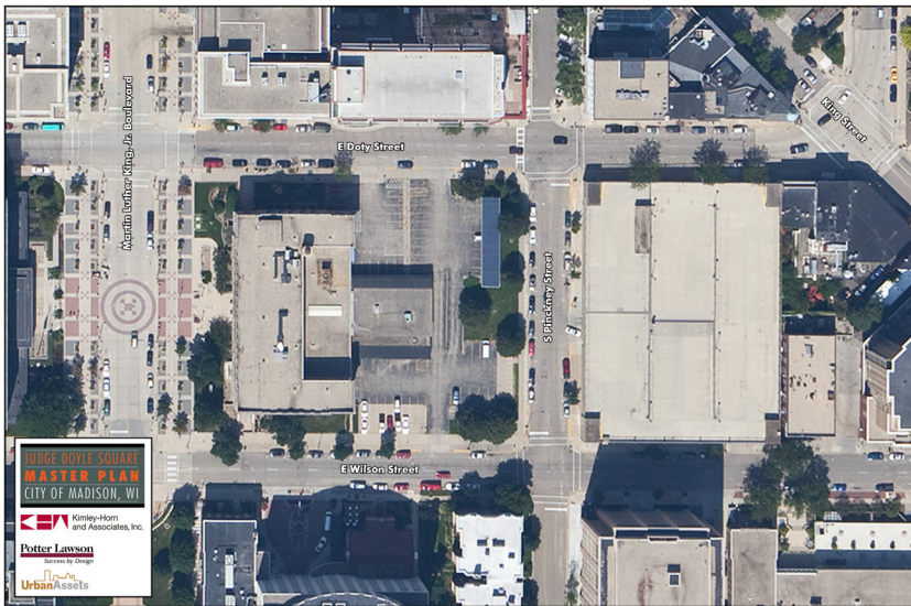
Blocks 88/105: Judge Doyle Square

If, at the end of the 18 month period, RFP Developer fails to enter into an agreement with a third party, then RFP Developer’s obligation to negotiate with Marcus in good faith is renewed for a period of 120 days, except the negotiation period shall be reduced to 60 days if the hotel/motel component is substantially the same as the one previously negotiated with Marcus.