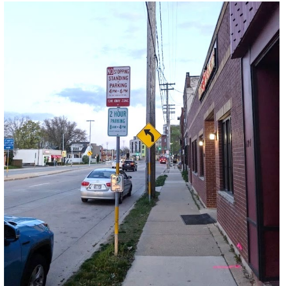
Figure 3.1 Southbound Park St Does not support a path