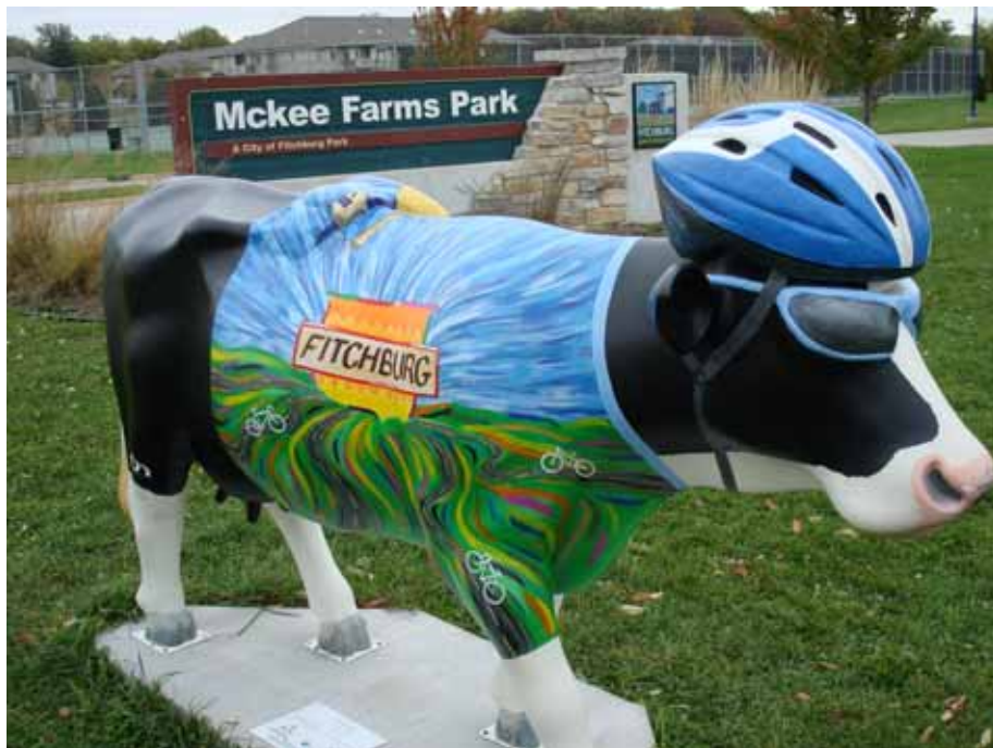
Fitchburg Bicycling Art Cow.

Finally, Madison is home to a significant percentage of the nation's bicycling industry. Improving bicycling conditions will increase the number of bicycle riders, and thus increase the direct and indirect positive economic impacts of the bicycling industry on the local economy.