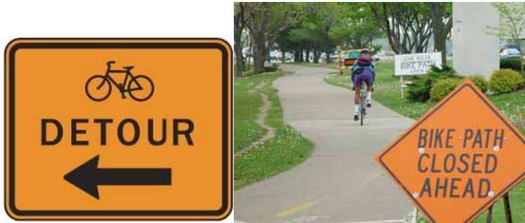
Bicycle Route Detour Sign.