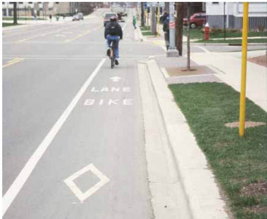
A complete street in Madison.

Madison has made many positive strides toward complete streets over the years, but now it is time to formalize the policy and implement it in a manner that will make our community a leader in the nation.