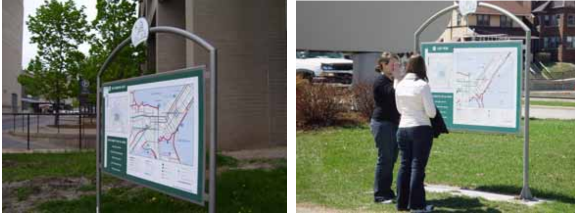
Wayfinding signs.