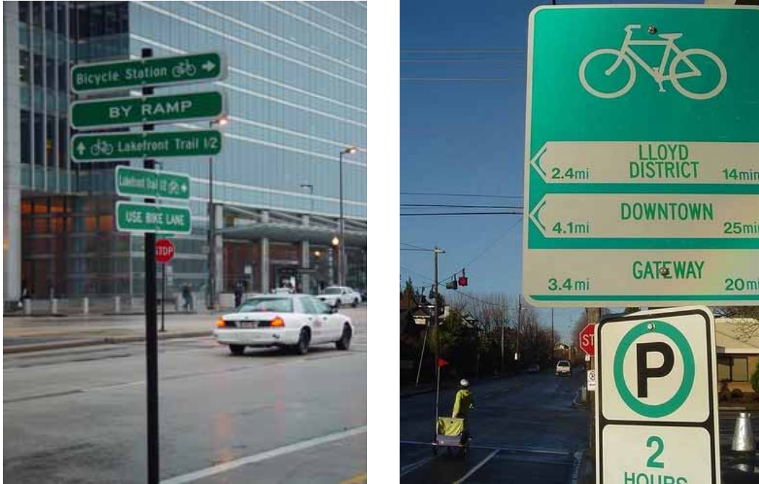
Examples of Destination Based Bike Network Signs (Chicago left, Portland right).