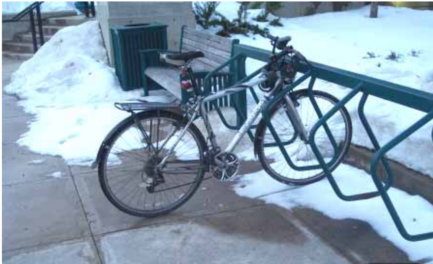
Bike Rack in Winter. Image: Arthur Ross