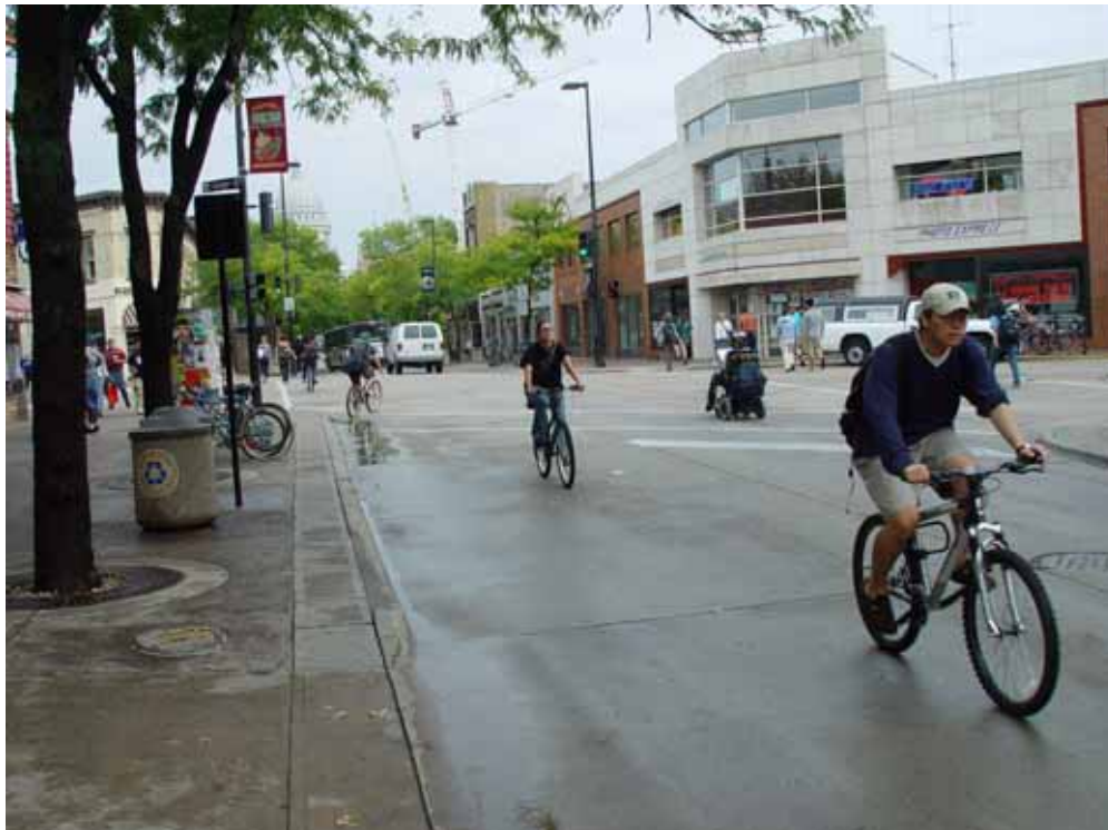
Madison’s State Street, which is closed to through automobile traffic.

Madisonians enjoy and value a high quality of life. Better conditions for bicycling and walking have tangible and intangible benefits to the quality of life. In cities where people can regularly be seen out bicycling and walking, there is a palpable sense that these are safe and friendly places to live and visit. Bicyclists are an indicator of quality of life, the proverbial “canary in the coalmine.” A contributing factor towards preserving and improving Madison’s high quality of life is making the City even more friendly to bicycling.