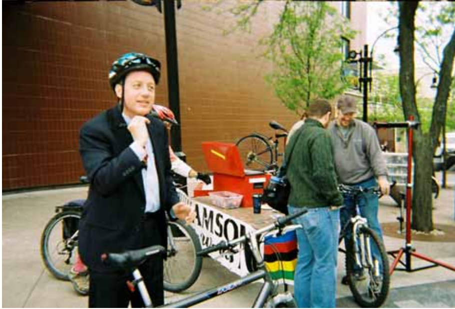
The Mayor arrives at Bike to Work Week press conference.