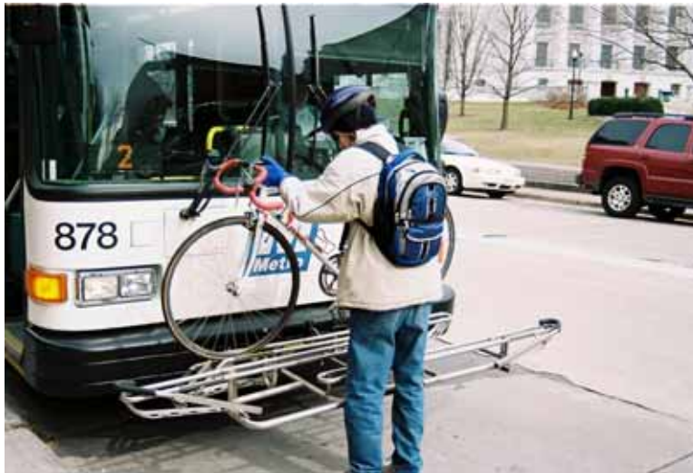
Bike Rack on Madison Metro Bus.