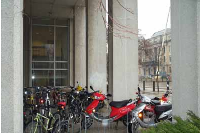
Mopeds parked at bike racks.