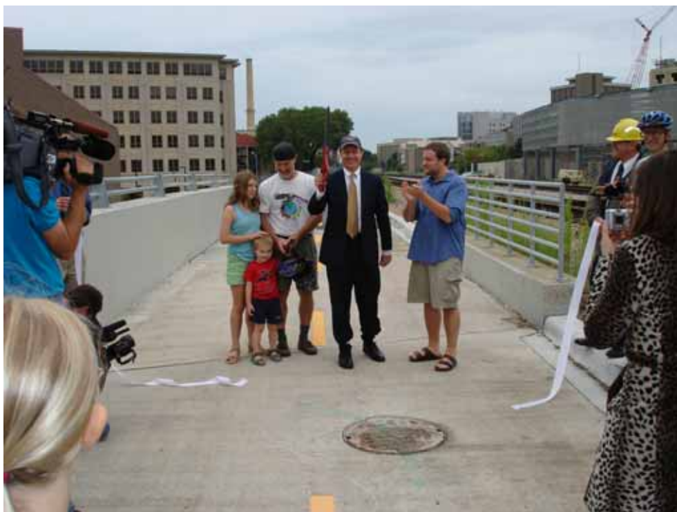
The Mayor cuts the ribbon at opening of “The Missing Link” path.

All of the great cities for bicycling (places like Boulder, Portland, Davis, Copenhagen, and Amsterdam) have become great cities for bicycling because of the visionary actions of citizens and government. The time is ripe for Madison to become the best city in America for bicycling. This report outlines how to build upon the excellent work which has already been accomplished through the efforts in the public and private sectors over many years in order to move towards becoming a Platinum Level Bicycle Friendly Community and beyond. It is up to the citizens of Madison to make it happen.