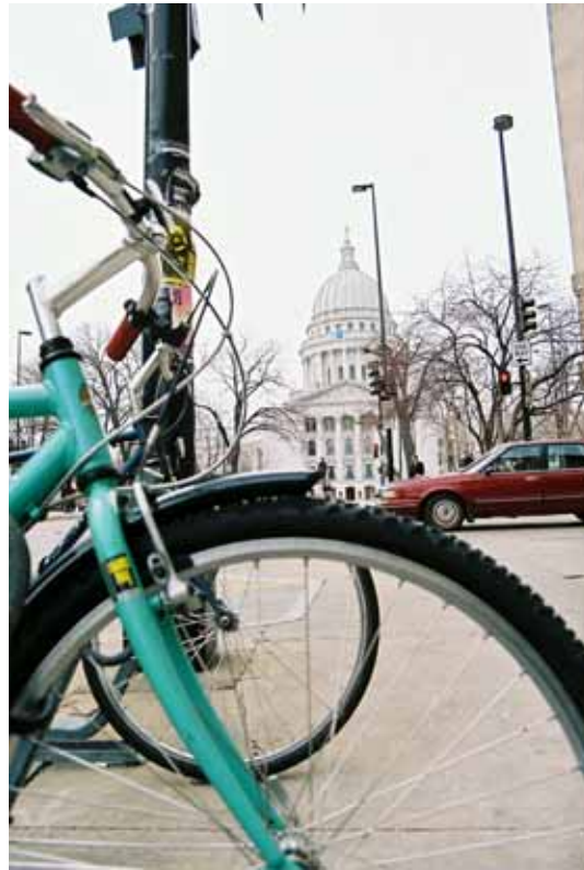
Bikes around the capital building..