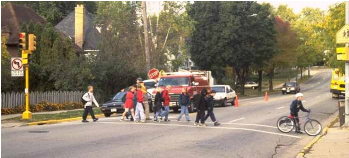
Kids heading to school.

Over the last several years an international movement has developed called Safe Routes to School, which seeks to improve children's ability to bike or walk to school by improving engineering, enforcement, education, encouragement, and evaluation. Though Safe Routes to School is a program or a combination of programs and policies that can be implemented, the Platinum Committee felt that it is also a theme that should be considered whenever improvements for bicycling and walking are discussed or made. All of the components of Safe Routes to School are incorporated in this report, though they are not always directly identified as such.