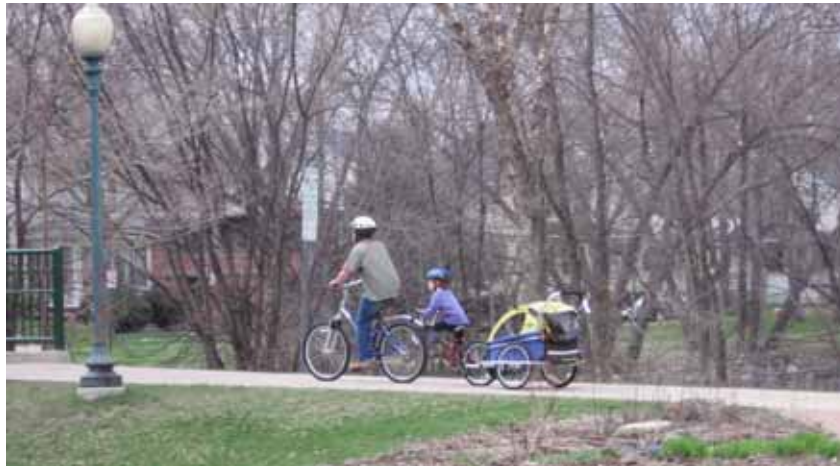
A family bicycles on Madison's east side.

Resources: Funding to come initially from the corporate sponsorships of the Platinum Committee. If successful, seek additional funding from the city or businesses