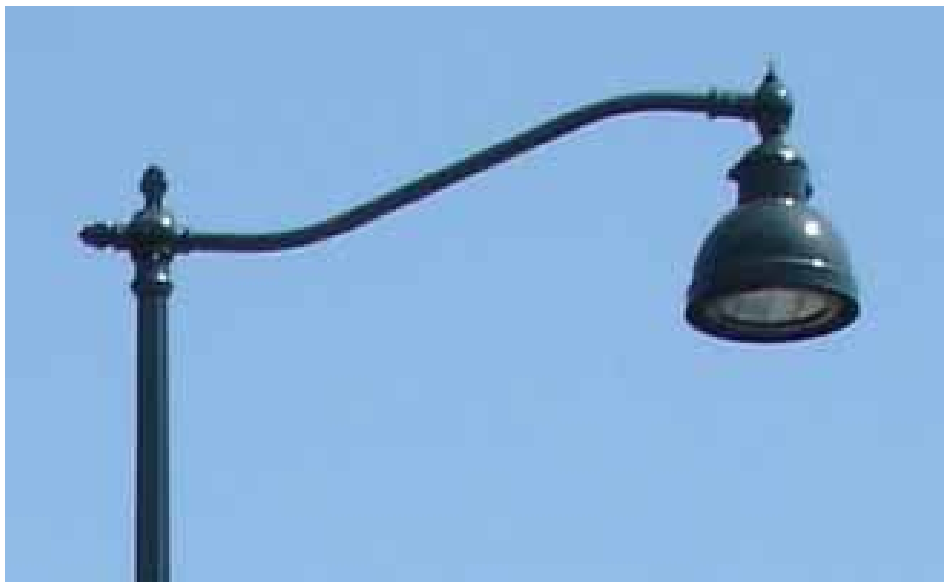
Cut off lighting on E Washington Avenue.

Resources: Staff time and cost of sign installation