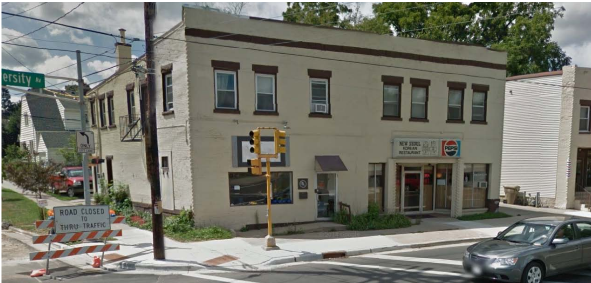
Google street view