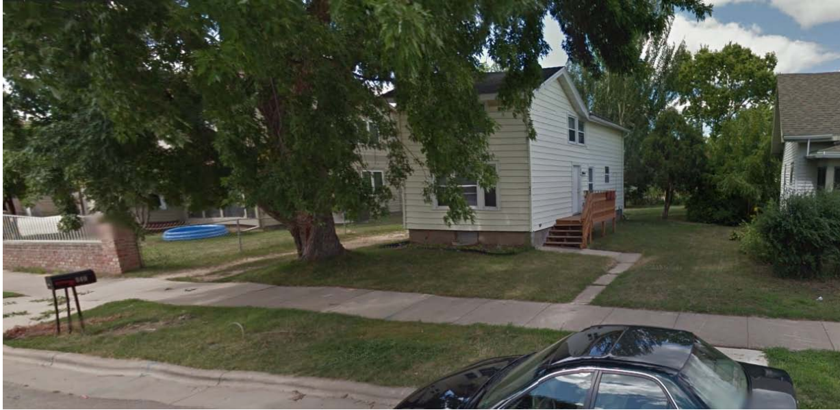
Google street view

Single family building. Constructed in 1935.