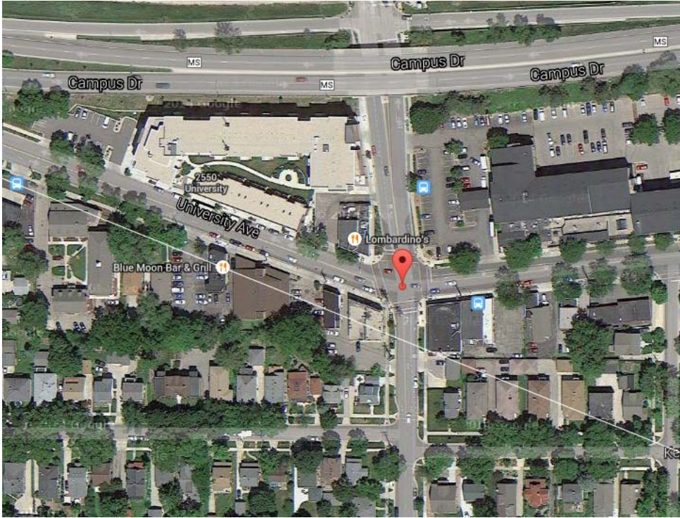
Google aerial view

Commercial building. Constructed in 1912 according to the assessor's records.