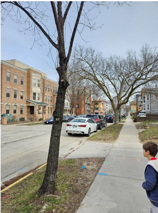
Figure 4 Timestamp 3/16/2024 11:22 am