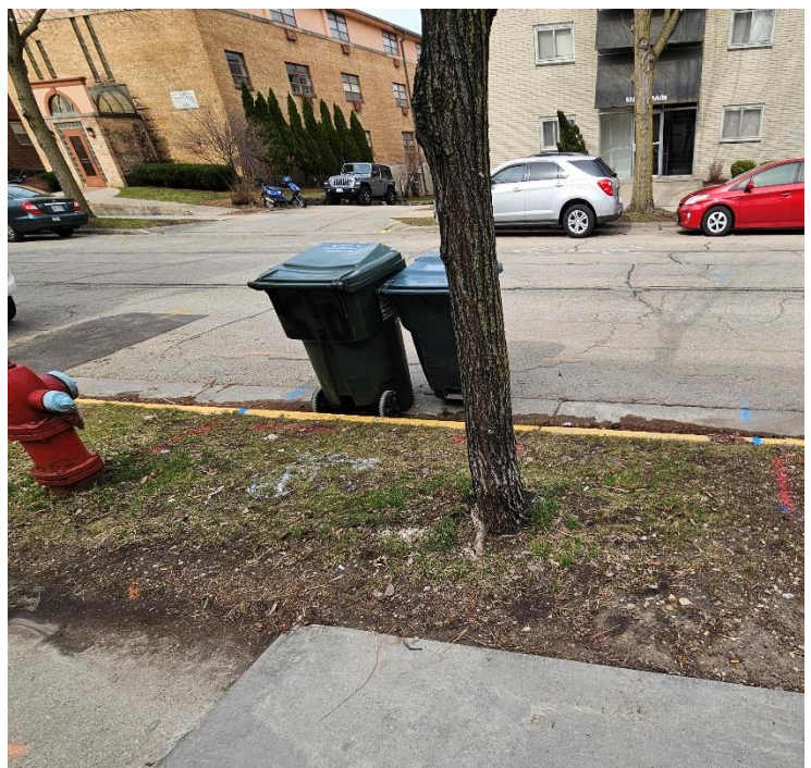
Figure 5 Timestamp 3/16/2024 11:22 am