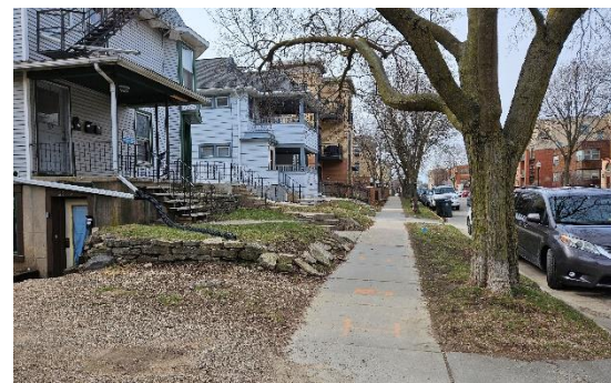
Figure 3 Timestamp 3/16/2024 11:27 am