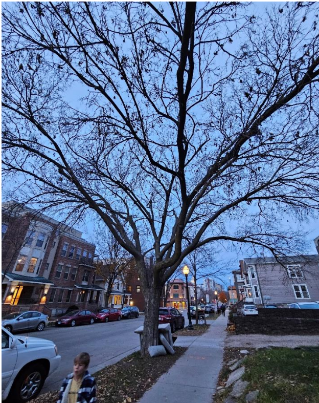
Figure 2 Timestamp 11/16/2023 4:41 pm