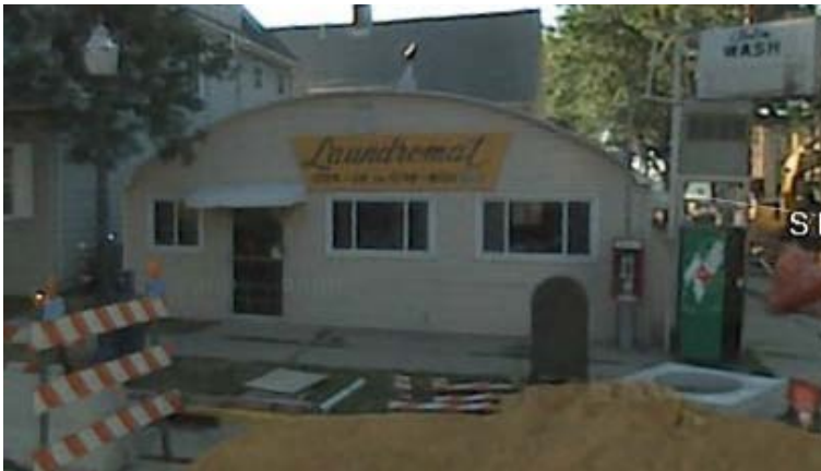
Google street view image

Quonset hut last used as laundromat. Built in 1948.