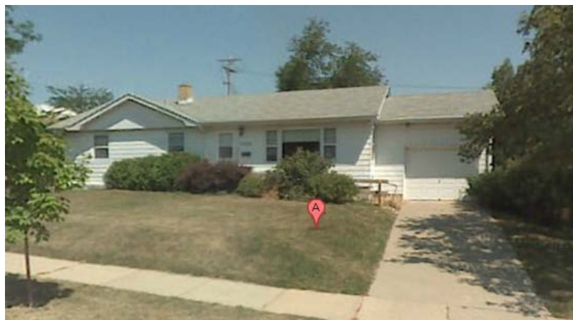
Google street view image