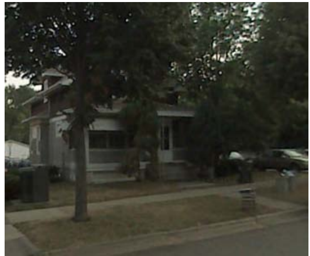
Google street view image