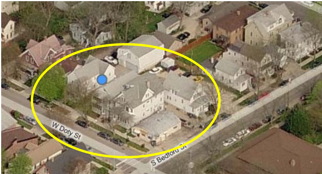
Bing maps image