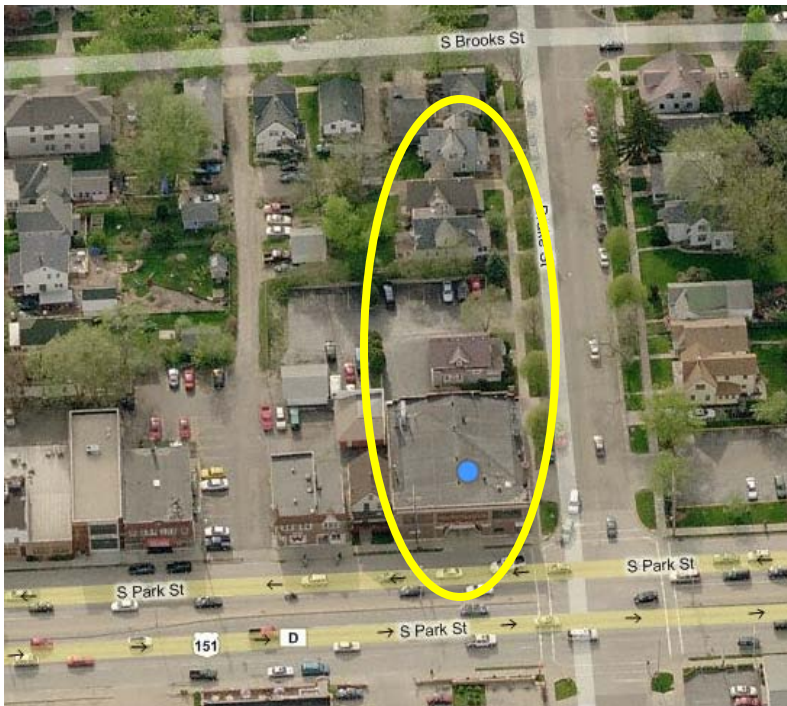
Bing maps image