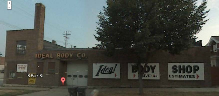
Google street view images