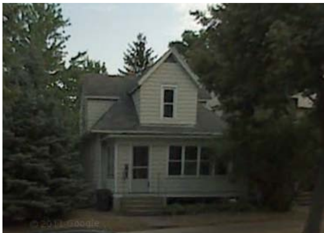
Google street view image