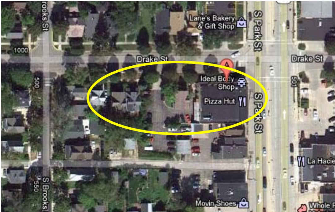
Google maps image