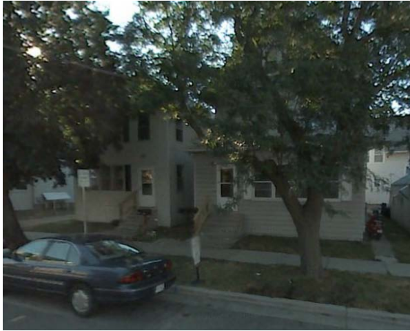
Google street view image

545 is a two flat built in 1889. 549 is a three unit built in 1912.