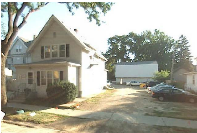
Google street view image