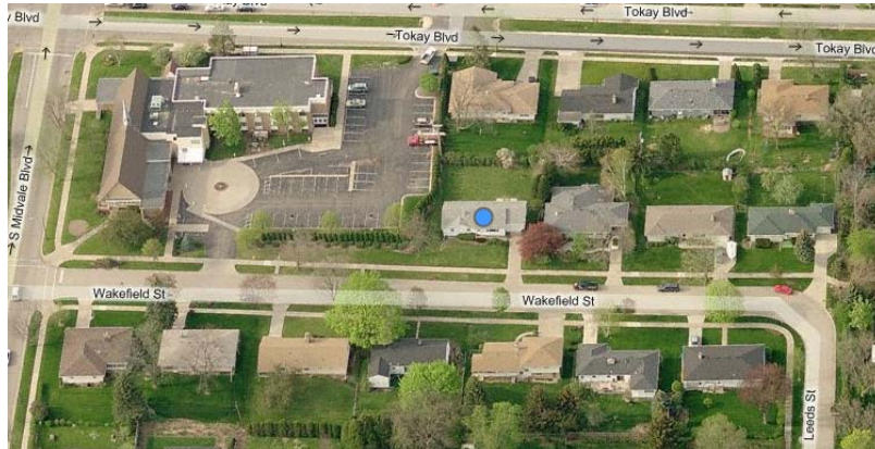
Bing maps image

4322 Wakefield Street Single family residence. Built in 1955.