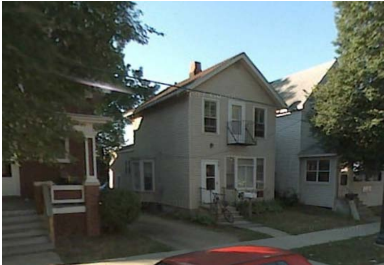
Google street view image

Staff findings: The preservation file notes the date of construction as “unknown”, but states that the building is shown on a 1908 map.