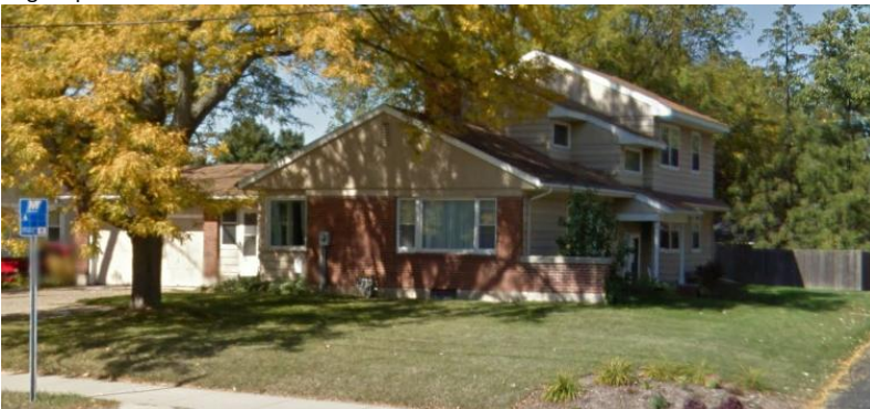
Google Street View --- 3926