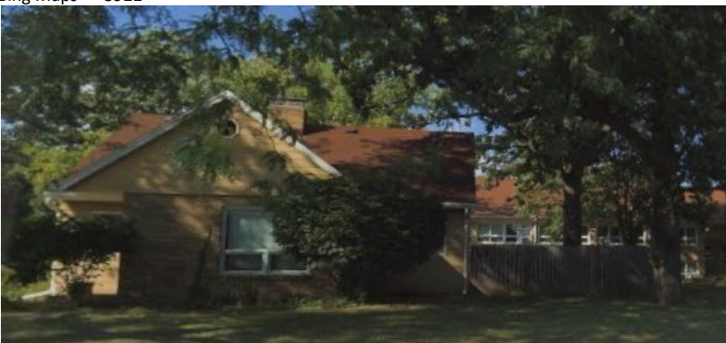
Bing Maps – 3922