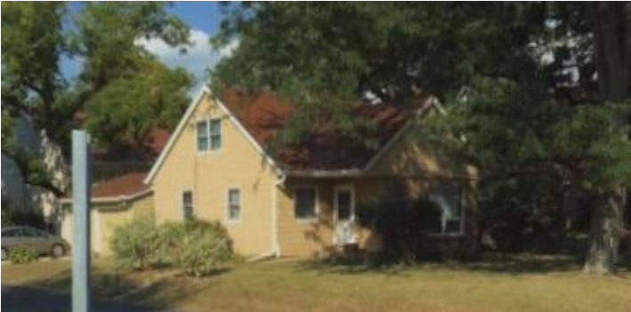
Bing Maps --- 3922

Two single-family homes, constructed circa 1955