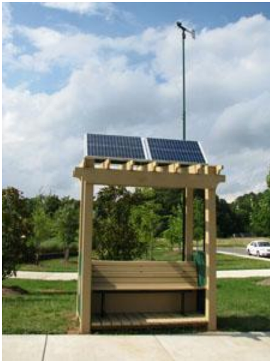
Figure 3 - USEPA Village Green Air Quality Monitoring Station

Mr. Williams is also a resource for information on other low-cost air quality monitoring equipment. For example, for PM2.5 monitoring he recommends the MET-ONE Neighborhood Monitor. This is a complete monitoring station which costs $2,500, requires only electrical power, and uploads its measurements directly to the internet. 2 Several of these monitors could be sited throughout the neighborhood. These monitors could be located in all wind directions around the Kipp factories as well as at Lowell Elementary School and the proposed apartment projects on Fair Oaks Avenue. Neighborhood residents could be participate in the siting the monitors. Sky Patton is the contact at MET-ONE at (541) 471-7111.