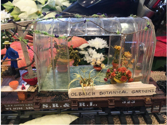
The theme for the December 2021 Holiday Train Show was Planes, Trains, and Automobiles. The show featured an array of colorful flowers and foliage surrounded by elements that represent the various forms of transportation.