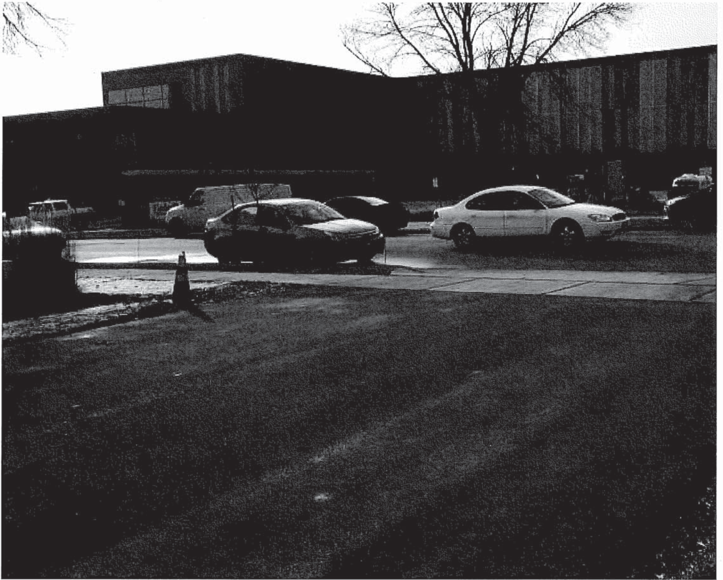
Obstructed view of WMTV's employee driveway from the street (Forward Drive facing north). It's worse when a truck or van parks here.