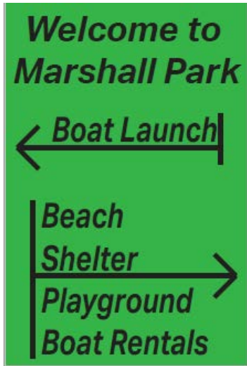
Example of Directional Sign*