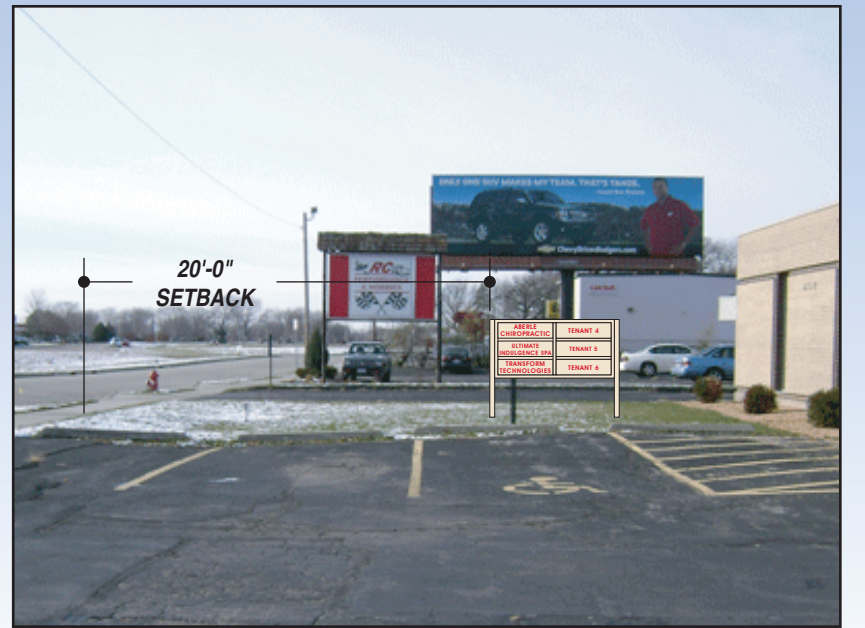
CONCEPTUAL RENDERING (*NOT TO EXACT SCALE)

Centroid Height: 3.500 ft Sign Area: 19.875 sq ft Number of Support Columns: 2 Wind Pressure: 30.000 lbs/ sq ft Section Modulus: 0.417 per column 2.500 inch Steel SQUARE Tube:(0.187 inch wall),each column Caisson type: Circular Base Diameter/Width: 1.500 ft Footing Depth: 3.500 ft per column Valid Footing Diameter: 1.500 ft per column Concrete Yards: 0.225 yards per column x 2 = 0.451 yards total