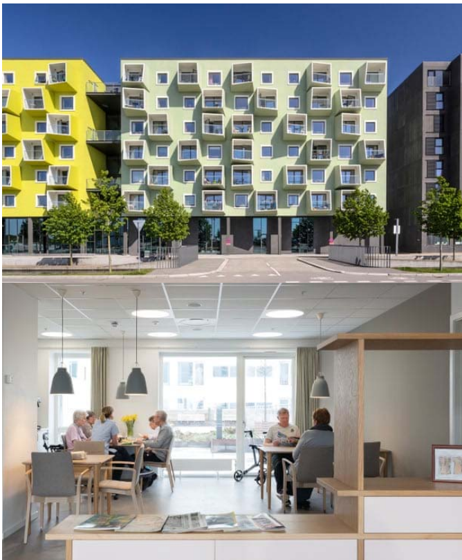
The Ørestad development in Copenhagen is classed as a retirement home but is also an example of stylish, practical housing.

Park points to the Ørestad development in Copenhagen as an example of stylish, practical age-friendly housing that caters for high levels of need. Classed as a retirement home, the living costs of Ørestad’s residents are subsidised by the municipality. The prominent and colourful building contains flexible social spaces, as well as a ground-floor cafe, hair salon and dental surgery that are open to the public. “People like to mix and feel connected. As many of the residents are living with advanced dementia, getting out is difficult - inviting the public in is a logical and positive response,” says Park.