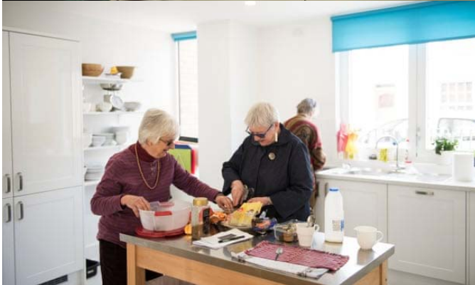
A design session for New Ground, left, and the communal kitchen of the completed project.