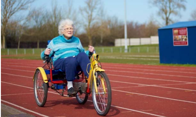
Wheels for Wellbeing offers sessions on specially adapted bikes, encouraging users to keep mobile, independent and fit.

Innovative schemes are making cycling more accessible to older people. In south London, disability charity Wheels for Wellbeing offers sessions on specially adapted bikes, encouraging users to keep mobile, independent and fit. For those who no longer