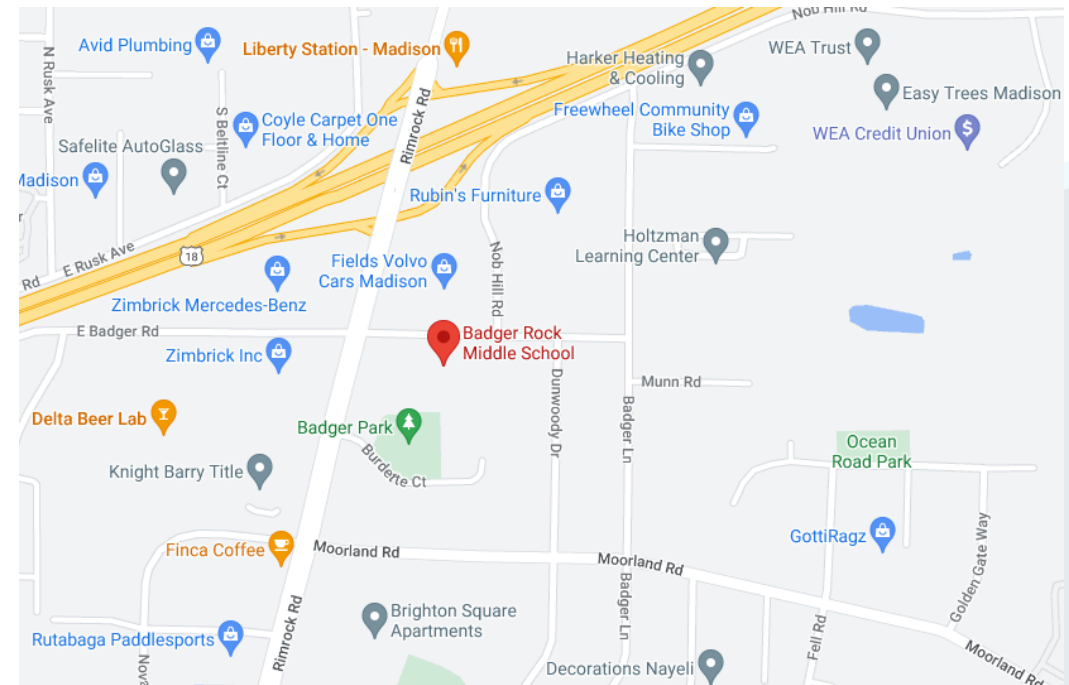
Map of new Southside Elementary location next to Badger Rock Middle School which is marked with a dot