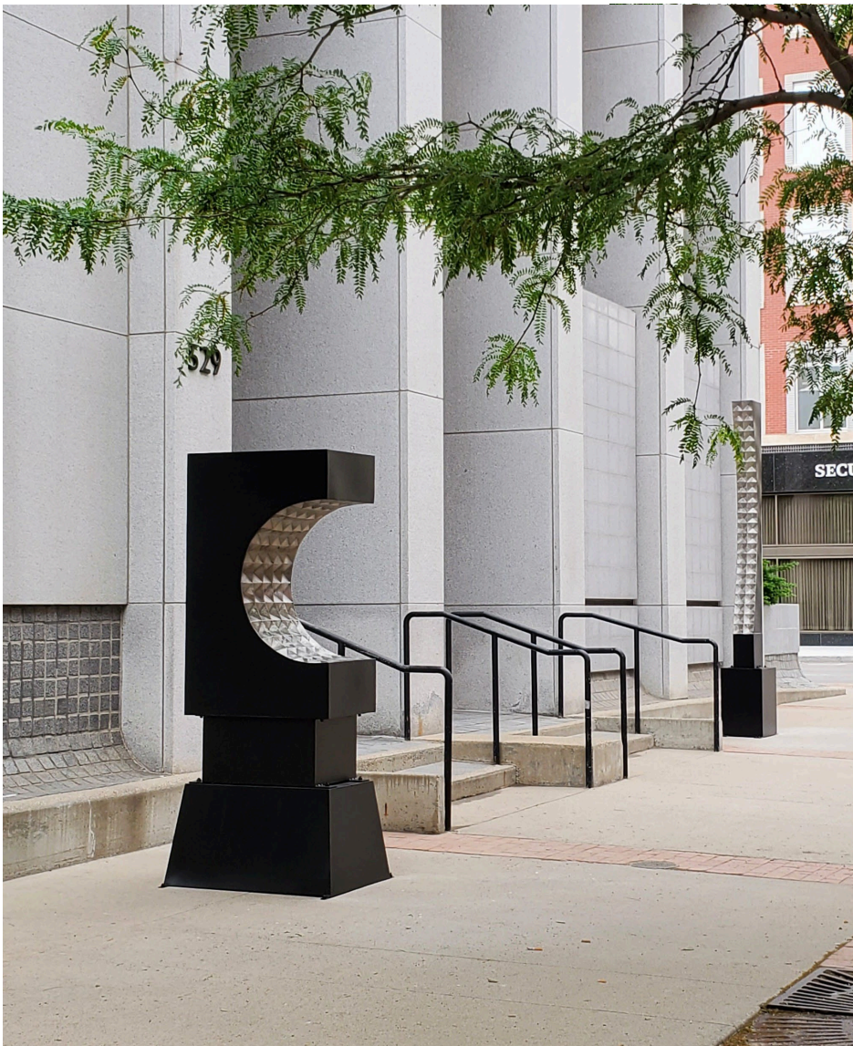
Arc I , painted & stainless steel, 200 lbs, 80”H x 30”W x 19”D Footprint: 24” x 34”, bolt to concrete or spot weld to steel