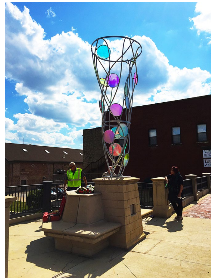
EXAMPLE BASE STYLE

Whorled , stainless steel and outdoor grade dichroic glass, 8' H x 4' W Base bolts directly to 4' concrete base, artist would create a matching pair or split this in half, up lighting needed