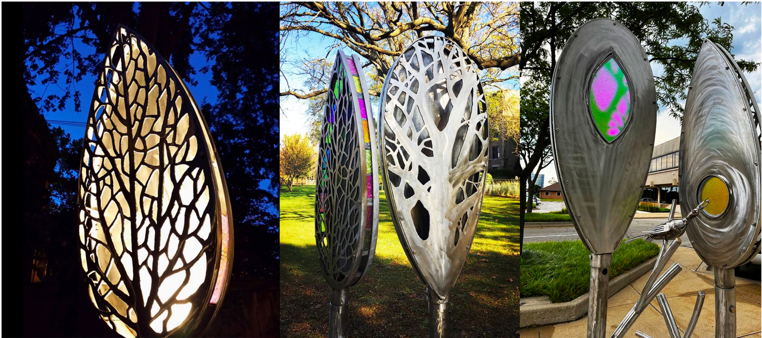
Peace Tree , stainless steel and outdoor grade dichroic glass, 400 lbs., 6'H x 4'W x 3'D Base bolts directly to 4' concrete pad, can be reworked to two separate sculptures, lit internally with LEDs