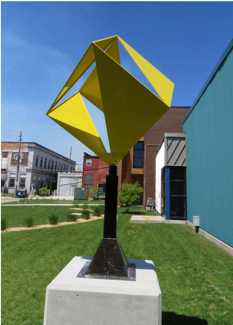
Blooming Yellow Tulip , painted steel Base bolts to concrete or spot welds to steel