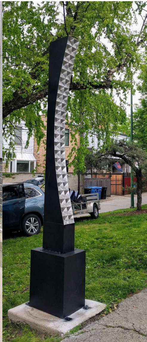
Arc II , painted & stainless steel, 180 lbs, 120”H x 16”W x 19”D Footprint: 24” x 34” bolt to concrete or spot weld to steel