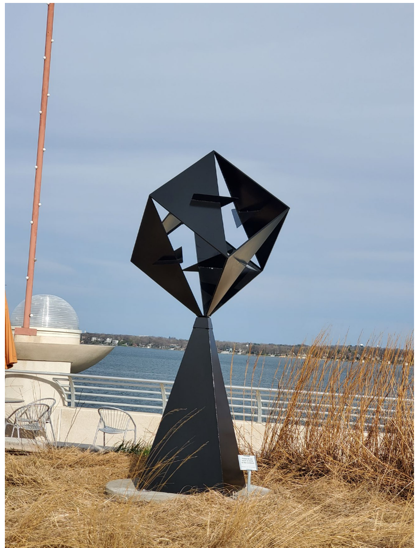
Triangle Play , painted steel, 120 lbs, 7' H x 4' W x 4' L Base bolts to concrete or spot welds to steel