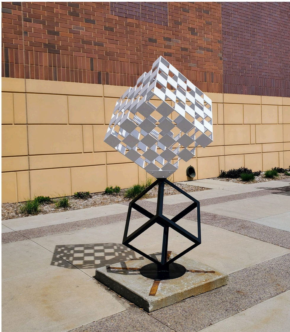
Snow , painted steel, Base bolts to concrete or spot welds to steel