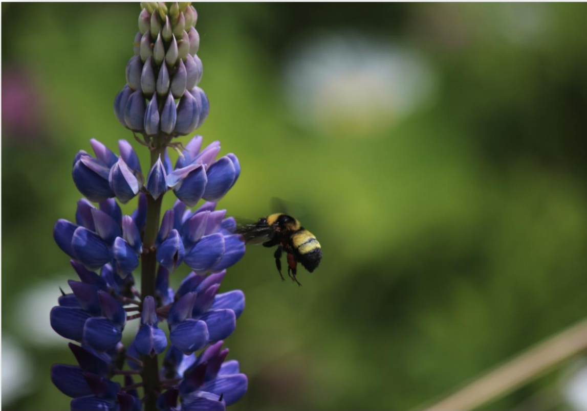
A bumblebee pollinates lupine