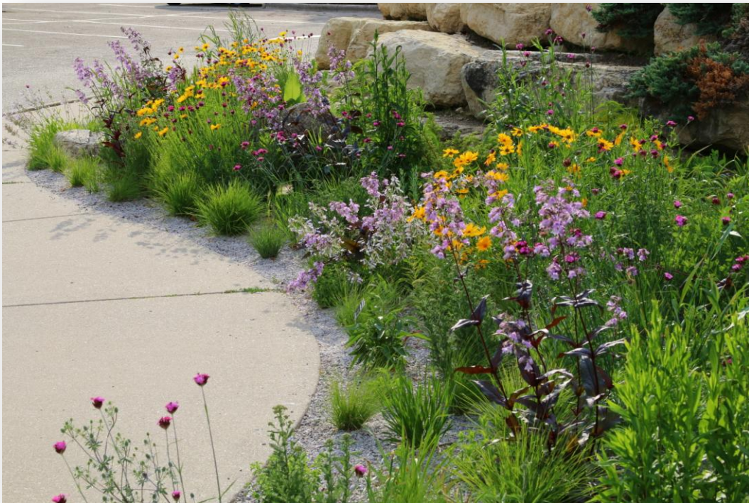
Olbrich's sustainable gravel gardens, with a diverse collection of perennials, provide exceptional habitat for birds and insects.

Olbrich has approximately sixteen acres of public garden. These sixteen acres are intensively cultivated and managed for education and passive recreation.