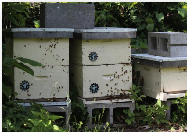
Mad Urban Bees honeybee hives at Olbrich Botanical Gardens

Olbrich Gardens already has a number of existing demonstrations of low-maintenance gardening; meadow planting; and right plant, right place landscaping. Currently all sixteen acres of Olbrich Gardens demonstrate pollinator-friendly, sustainable gardening. Olbrich marketing staff encourages the public to visit the gardens as inspiration for home gardens and to offer ideas in sustainable gardening. Considerable information about practices used is available to the public in the Schumacher Library at the gardens. Olbrich’s Education Programs offer classes year-round on many sustainable horticulture topics. Events like Olbrich’s Blooming Butterflies—held for two weeks during the summer—offer an excellent opportunity for wildlife education. Explorer School Programs offer grades K – 5 hands-on learning experiences that support Wisconsin Model Academic Standards for science and that supplement classroom curricula.