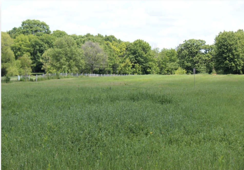
Warner Park dog park area

Land management within Parks varies based on its designated purpose. Conservation Parks are primarily used for passive recreation, with the notable exception of cross-country skiing and snowshoeing in the winter. Within General Parks, most of the acreage is not used for active recreation. Generally, land that is mowed as a finish cut is used actively.