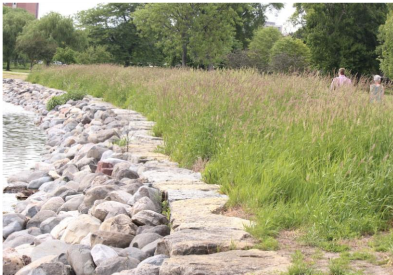
Brittingham Park, along the Monona Bay shoreline

Madison Parks operates under the philosophy that protecting parks land equals protecting assets for years to come. The City of Madison has 14 conservation parks totaling over 1,600 acres. Conservation parks are managed to preserve the native plant communities, wildlife, and the natural landscape. These parks are developed for controlled public access and managed to preserve and restore native plant and animal populations. Within each of these specialty parks are pollinator-friendly habitats that promote and welcome pollinators.