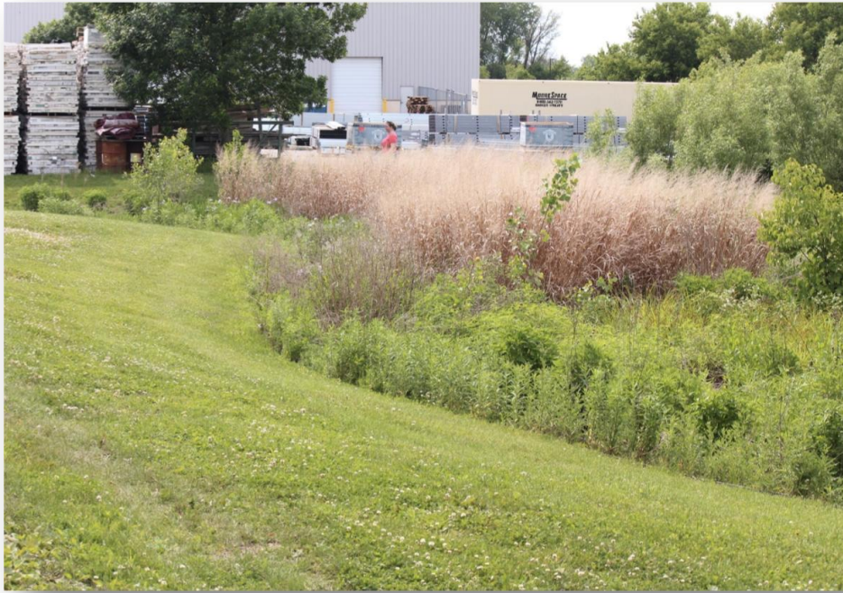
Greenway and rain garden at the police training facility on Femrite Drive