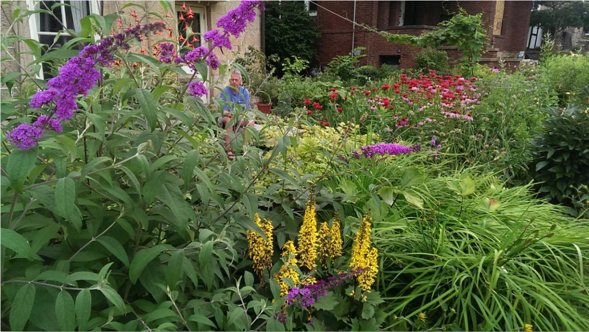
One of many pollinator-friendly yards in the City of Madison

As numbers of honeybees and native pollinators continue to decline, it is essential to take steps to not only protect pollinators, but to create an environment in which they will thrive. The City of Madison Pollinator Protection Task Force is tasked with the goals of: