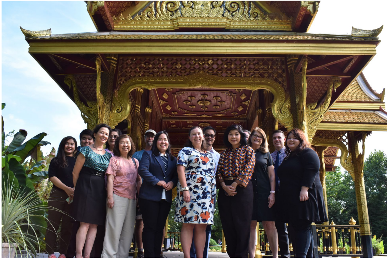
Figure 2 Staff from the Thai Consulate, UW-Madison, Parks, & Olbrich Gardens gather in front of the Royal Thai Pavilion.

On September 1 st , 2022, Olbrich Botanical Gardens hosted a delegation from the Thai Consulate in Chicago, IL. The Deputy Consul-General and her staff visited the Royal Thai Pavilion at Olbrich Gardens for their first time. Also attending were staff from the University of Wisconsin Campus Planning Department. The Deputy Consul-General is interested in bringing back the popular Thai Festival and staying informed about the Royal Thai Pavilion restoration project.