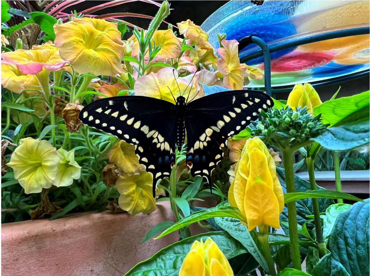
Figure 1 Giant swallowtail (Papilio cresphontes) feeds on a flower in the Conservatory.

In late July-early August, butterflies once again took flight in the Bolz Conservatory. Over the three week run of Blooming Butterflies almost 24,000 guests visited to enjoy butterflies of various shapes, colors, and sizes. Special programs were held offering families the opportunities to explore the Conservatory before opening at 10am. A special Butterfly Action Day was held to promote ways to protect and promote butterflies. Various media sources covered the exhibition.