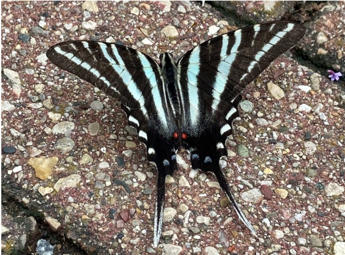
Figure 4 Zebra swallowtail ( Eurytides marcellus ) butterfly spotted at Olbrich Gardens

Zebra swallowtail ( Eurytides marcellus ) was spotted in the Sunken Garden by Horticulturist Samantha Malone. The zebra swallowtail is widely distributed from southern New England west to eastern Kansas and south to Texas and Florida. Southern Wisconsin is a small part of its normal range, so a sighting in Madison is quite rare. Sam shared her sighting on iNaturalist and the word was out! For a couple weeks, butterfly enthusiasts from Madison and beyond were sighted in the gardens with binoculars and cameras in hand looking for the zebra swallowtail. It wasn't the only rare butterfly sighting in the gardens this summer either! Build it and they will come, build pollinator habitat that is!