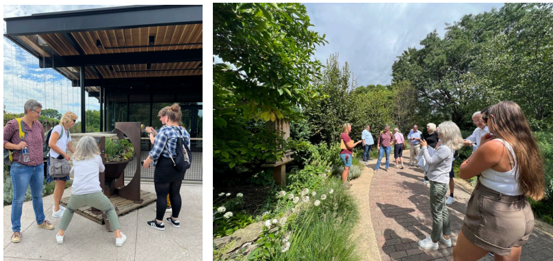
Figure 3 Guests from Freiburg, Germany enjoy exploring the gardens.

On September 1 st , 2022, Olbrich Botanical Gardens hosted a delegation from the Thai Consulate in Chicago, IL. The Deputy Consul-General and her staff visited the Royal Thai Pavilion at Olbrich Gardens for their first time. Also attending were staff from the University of Wisconsin Campus Planning Department. The Deputy Consul-General is interested in bringing back the popular Thai Festival and staying informed about the Royal Thai Pavilion restoration project.