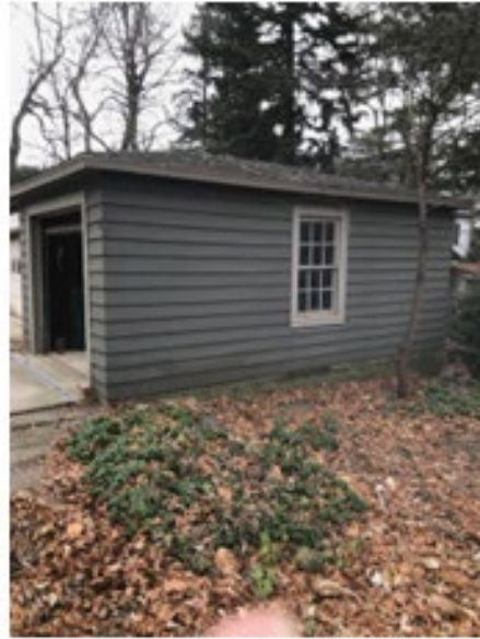
SIDE OF EXISTING GARAGE