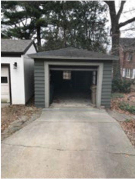
FRONT OF EXISTING GARAGE