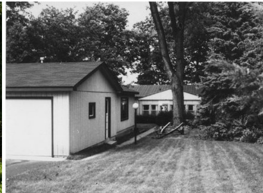
Wisconsin Historical Society