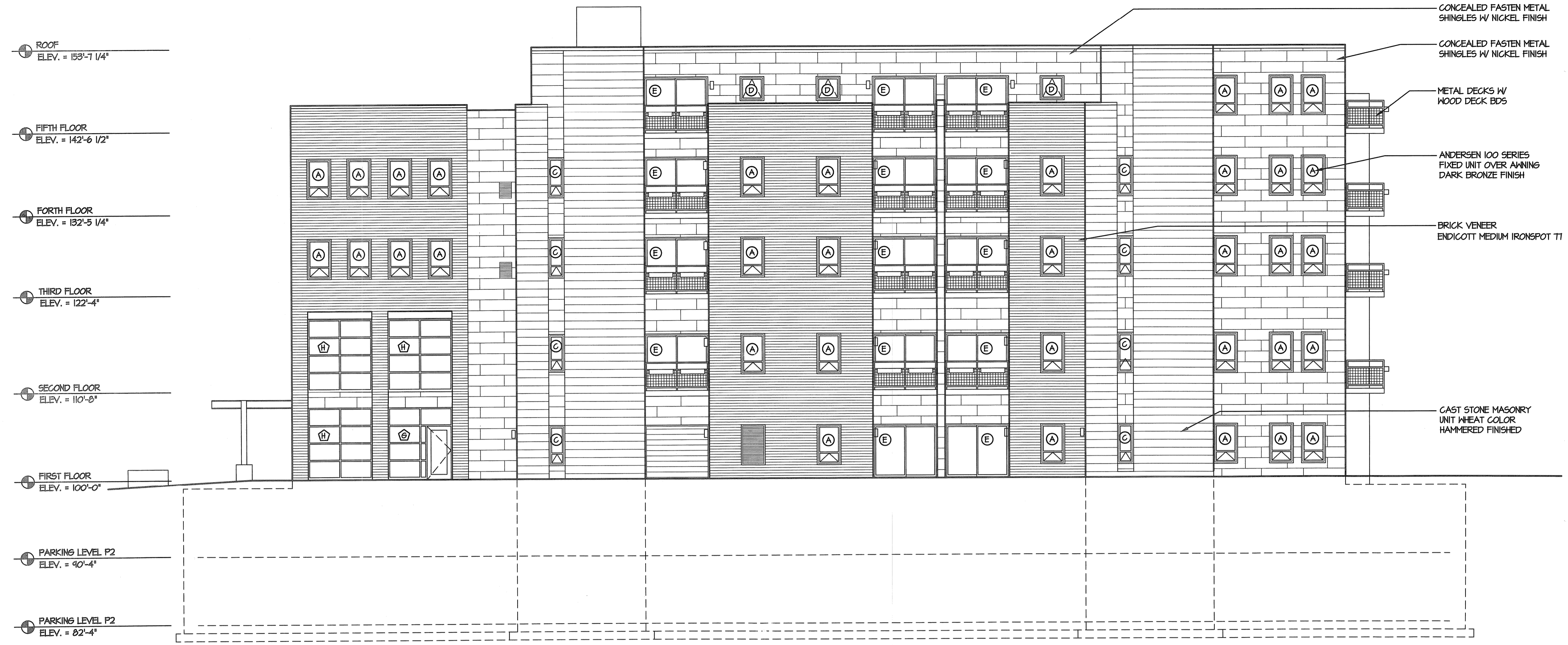
2 A22 SOUTHWEST ELEVATION SCALE 1/8" = 1'-0"