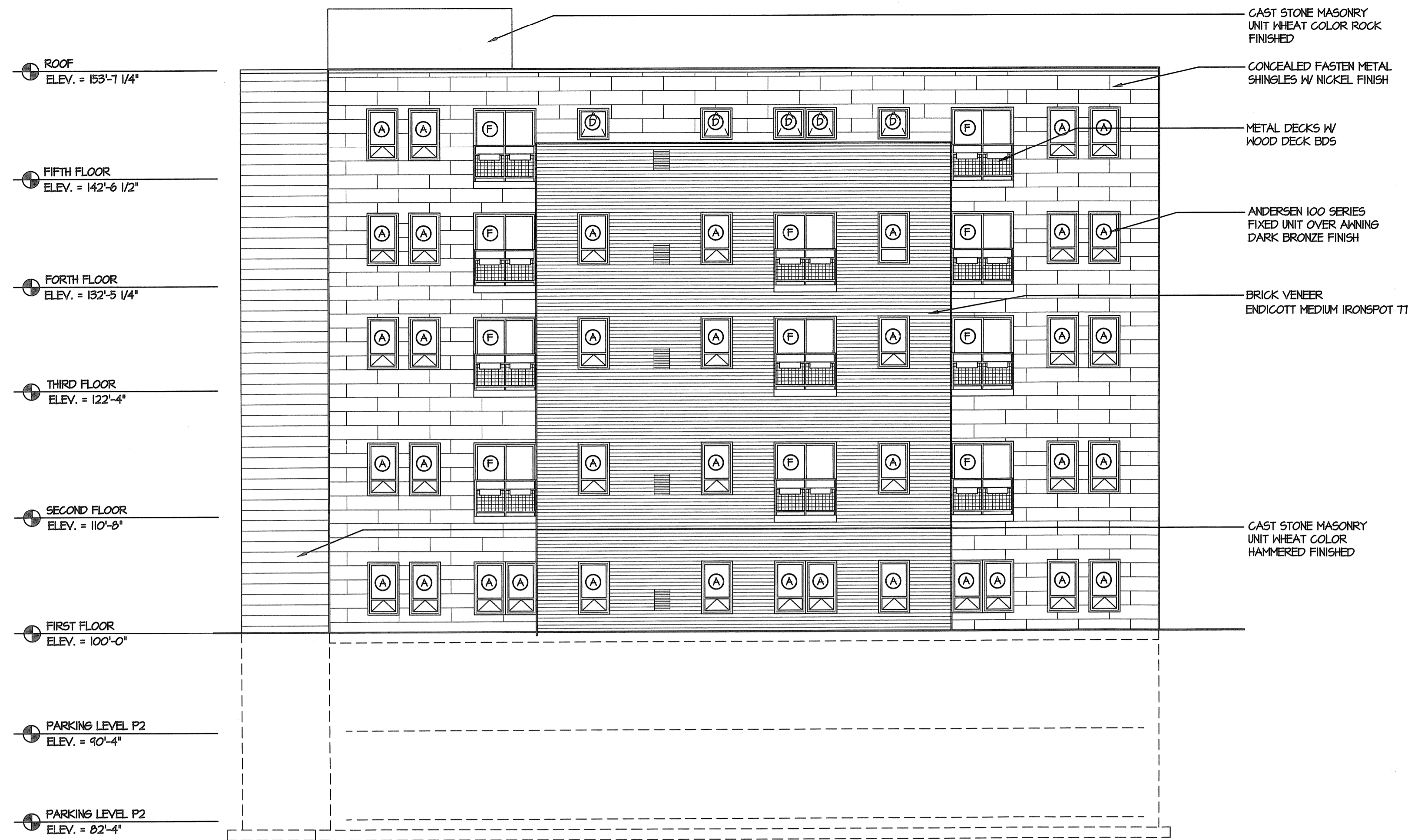
2 A2.1 SOUTHEAST ELEVATION SCALE 1/8" = 1'-0"