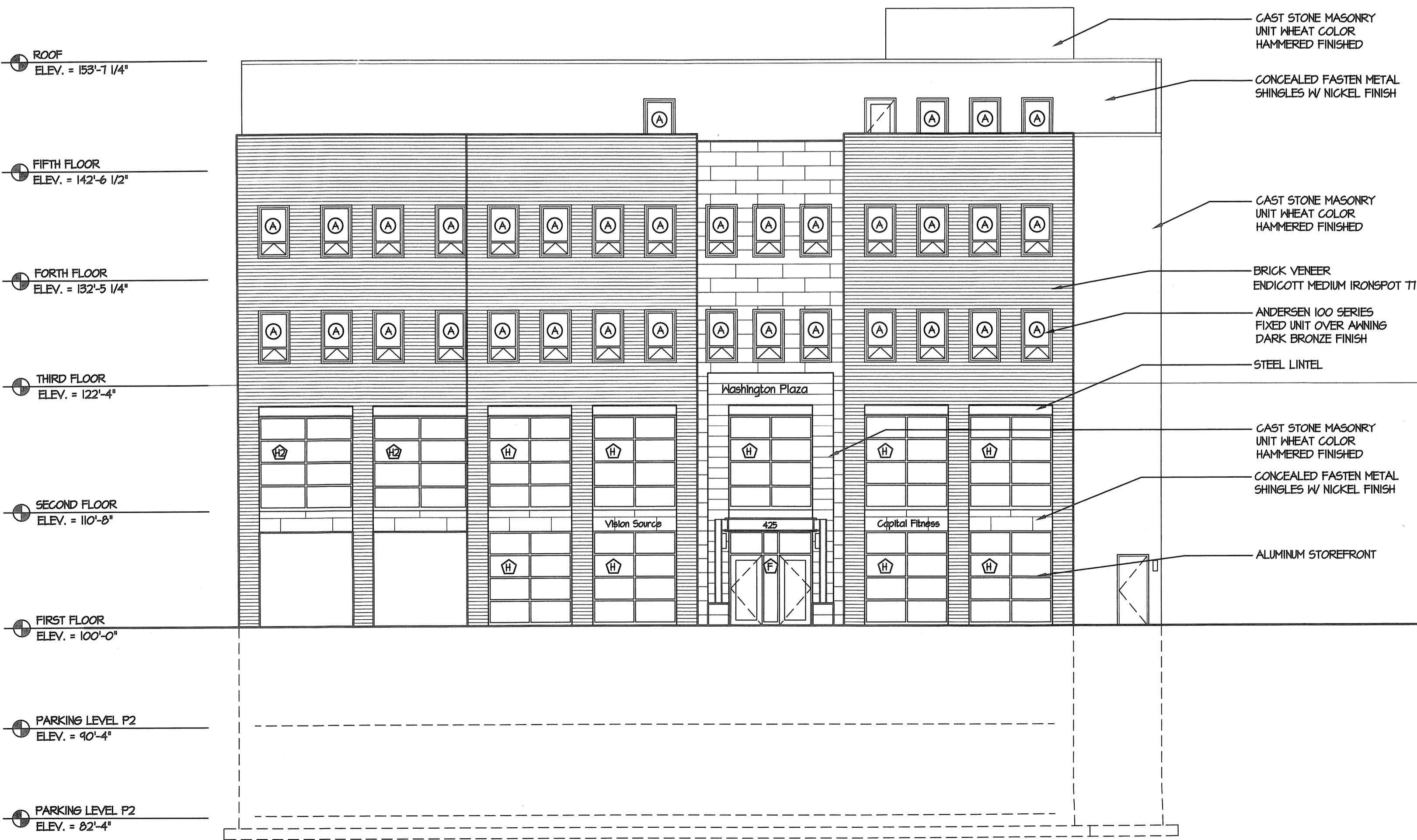
1 A2.2 NORTHWEST ELEVATION SCALE 1/8" = 1'-0"

PROJECT Washington Plaza Residential 425 W. Washington Avenue Madison, Wisconsin 53703 DRAWING SE, NW, BUILDING ELEVATIONS