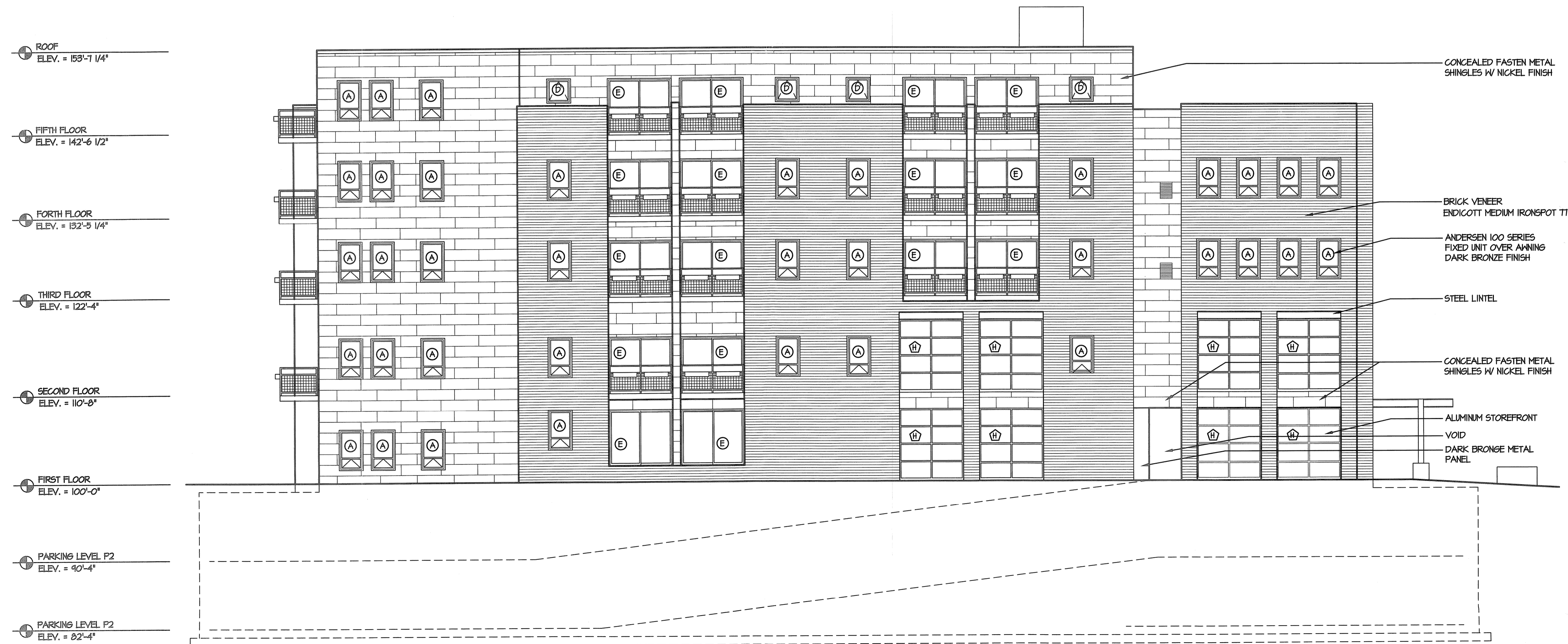
2 A21 NORTHEAST ELEVATION SCALE 1/8" = 1'-0"

PROJECT Washington Plaza 425 W. Washington Avenue Madison, Wisconsin 53703 DRAWING BUILDING ELEVATIONS