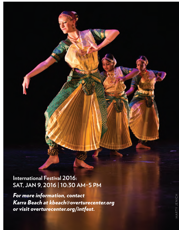
International Festival 2016: SAT, JAN 9, 2016 | 10:30 AM-5 PM