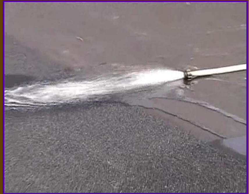
Standard Asphalt (right) & Porous Asphalt (left)

Open graded pavement leaves more visible voids on surface to allow water penetration.