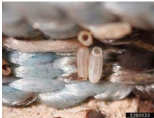
Egg sack of a bed bug.

Except for the “thermal” option, most chemical applications will kill the adults and immature bugs in a few hours. The eggs may not be in contact with the pesticide and thus may need multiple treatments to get rid of. Eggs hatching in the 10-day period are likely to be killed during the two-week treatment interval.