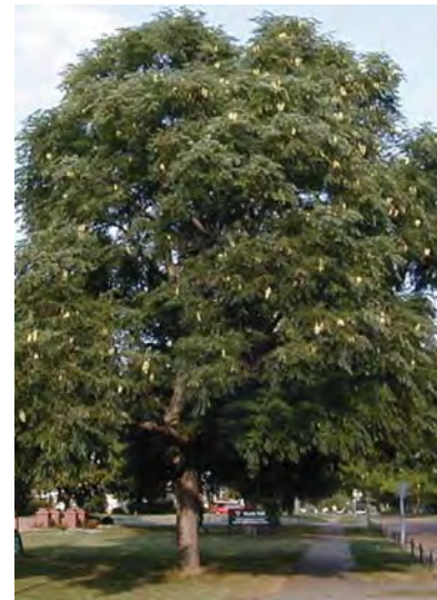
KENTUCKY COFFEE TREE