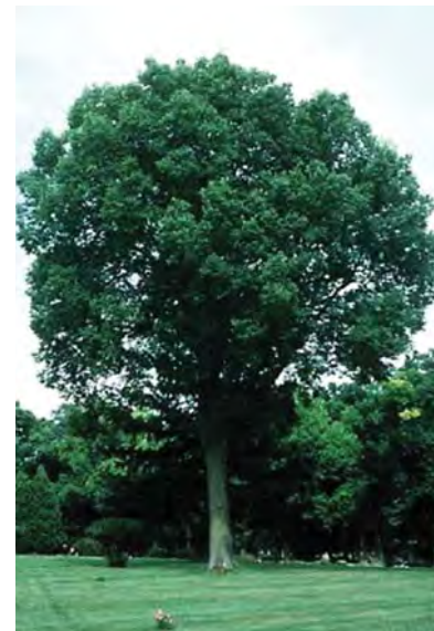
HACKBERRY - HEIGHT 55'