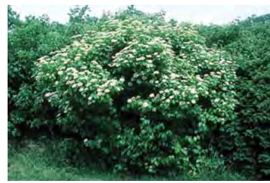
ARROWWOOD VIBURNAM 5-6' HEIGHT