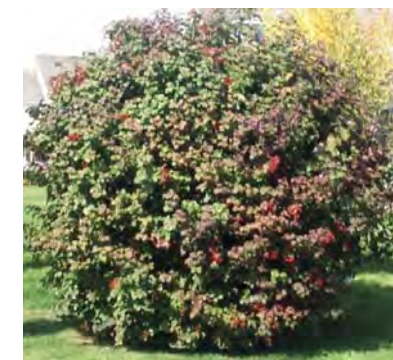
AMERICAN CRANBERRY BUSH VIBURNUM 8-12'