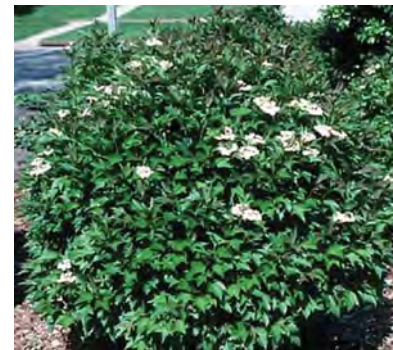
COMPACT AMERICAN CRANBERRY BUSH VIBURNUM 6-8'