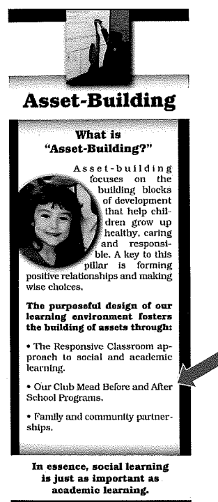
Figure 3: Example of Informational Brochure

After school programming in Menasha, Wisconsin, is provided at each elementary and middle school in the district. Although no school day teachers work for the program directly, program staff include