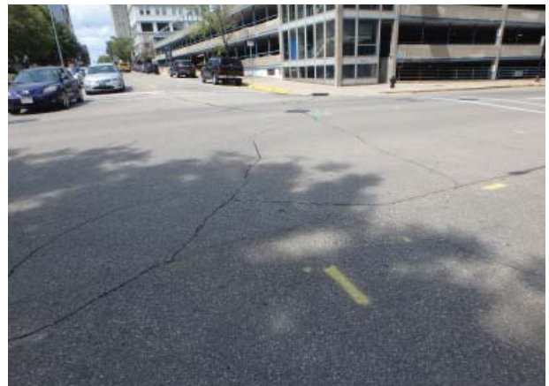
Intersection of West Wilson and Pinckney (Fair condition)