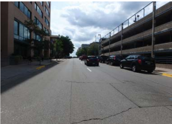
West Wilson Street (Good to Fair condition)