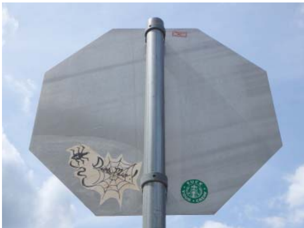
Stickers on Traffic Signs