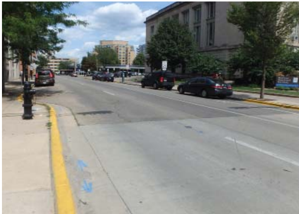
West Doty Street (Good to Fair condition)