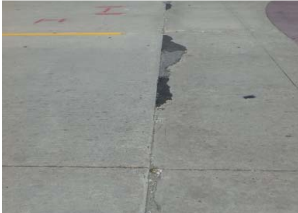
Martin Luther King Jr. Blvd, asphalt patches (Fair to Poor condition)