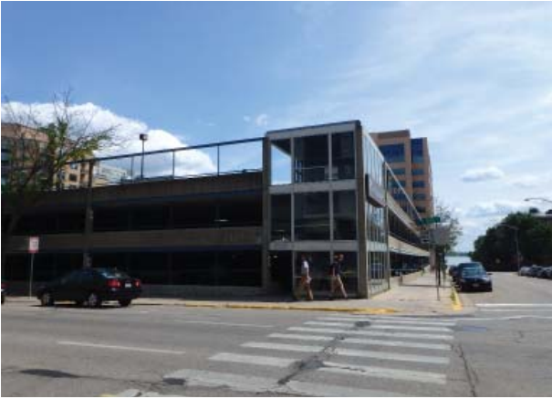
Intersection of Doty and Pinckney looking East (Fair to Poor condition)