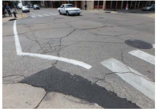
Intersection of West Doty and Pinckney looking south, cracks and patchwork (Poor condition)