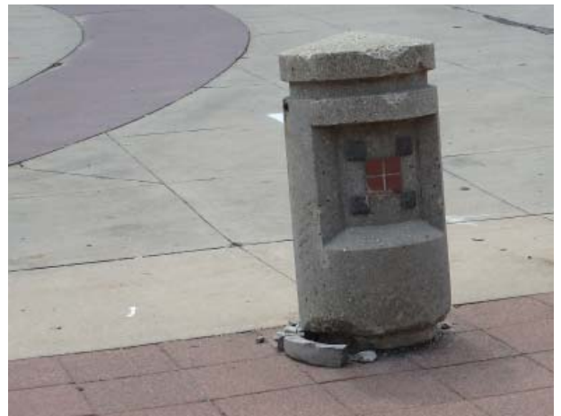
Martin Luther King Jr. Blvd Bollards (leaning & crumbling)