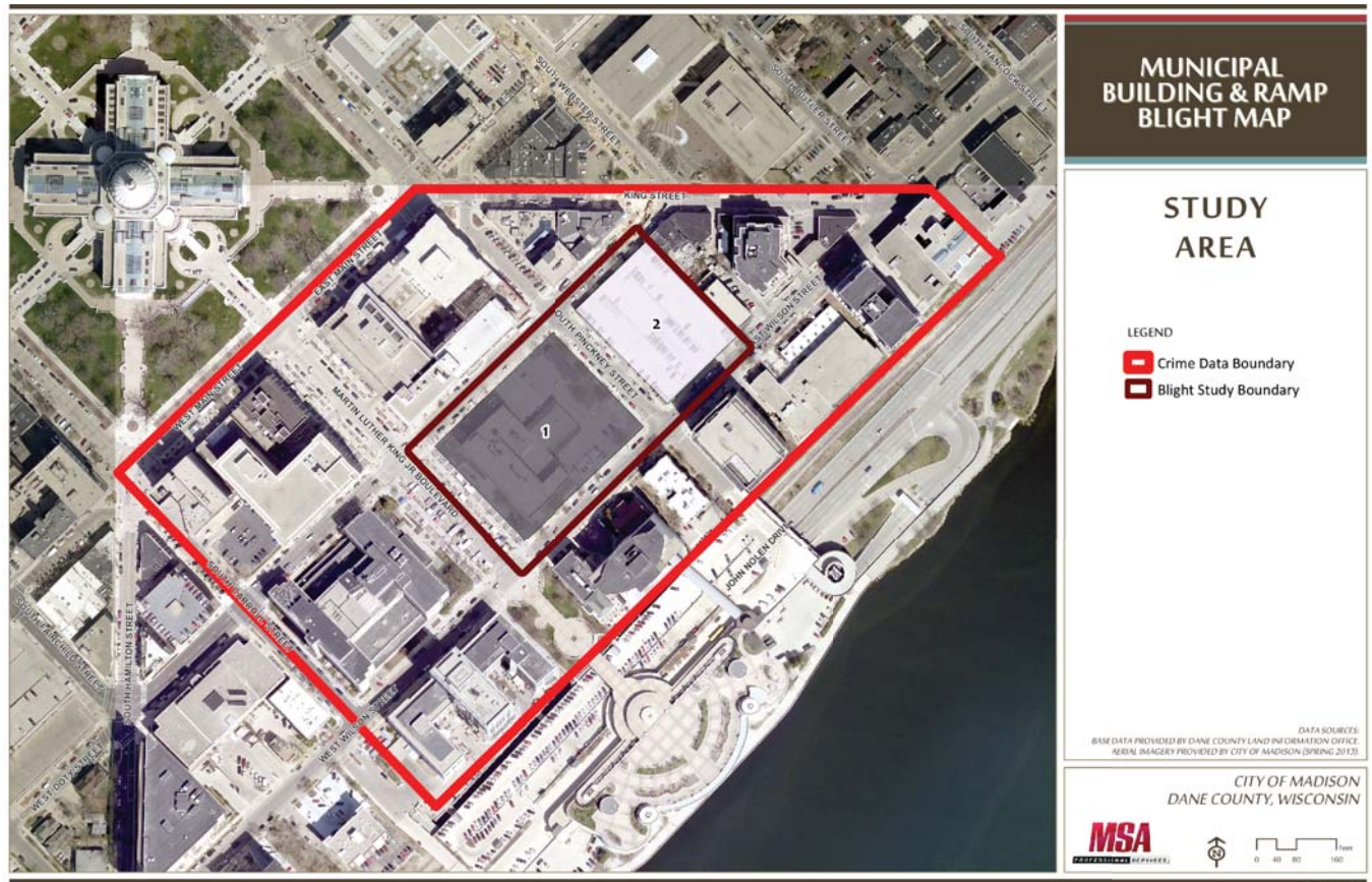
Figure 4.1: Police Data Boundary

To analyze the levels of crime within the Municipal Building & Ramp Study Area, we examined the number of police calls in both the near vicinity of the parcels (see Figure 4.1 for area included) and city-wide from 2010 to 2014 on a per-acre basis (calls divided by acres). Data was provided by the City. We compared both total police calls and several specific types of calls.