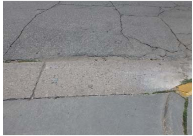
Ramp entry drive on Pinckney Street (Poor condition)