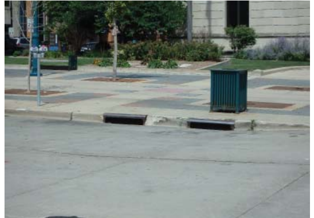
Martin Luther King Jr. Blvd, curbs missing chunks (Fair to Poor condition)