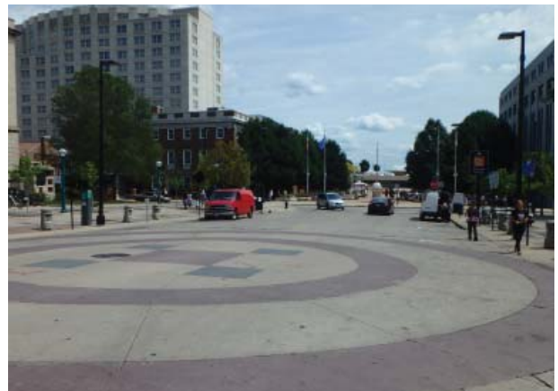
Martin Luther King Jr. Blvd (Good condition)