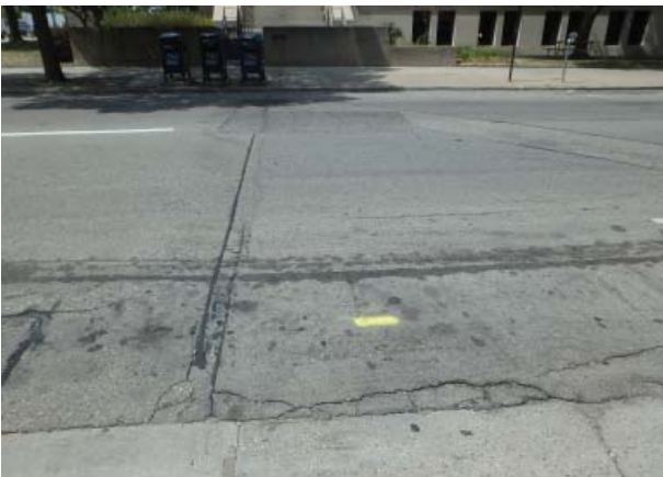
West Wilson near MLK Jr. Blvd (Fair condition)