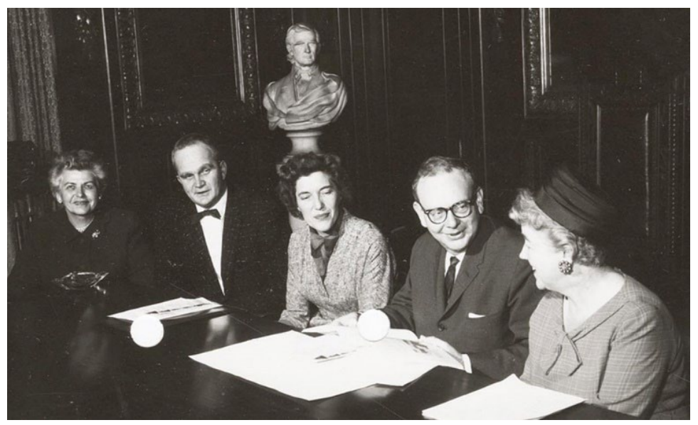
Governor's Commission on the Status of Women. May 8, 1968.