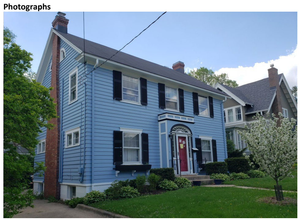
Drive and front view looking southwest. 2229 Eaton Ridge, 2023.