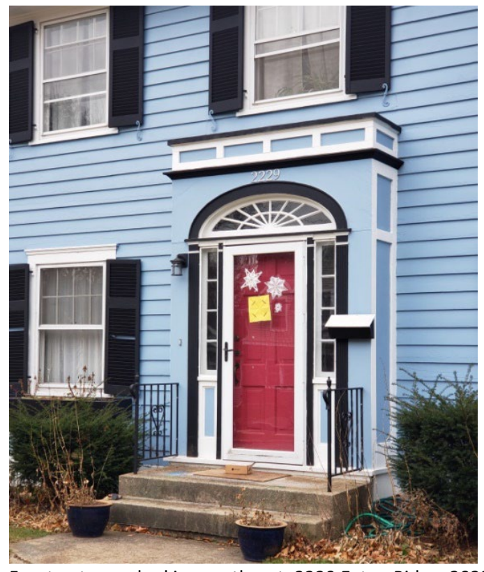
Front entrance looking southeast. 2229 Eaton Ridge, 2023.