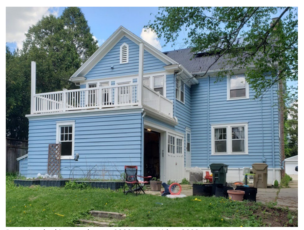
Rear view looking northwest. 2229 Eaton Ridge, 2023.