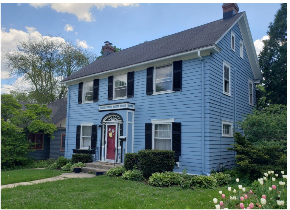
Front view looking southeast. 2229 Eaton Ridge, 2023.