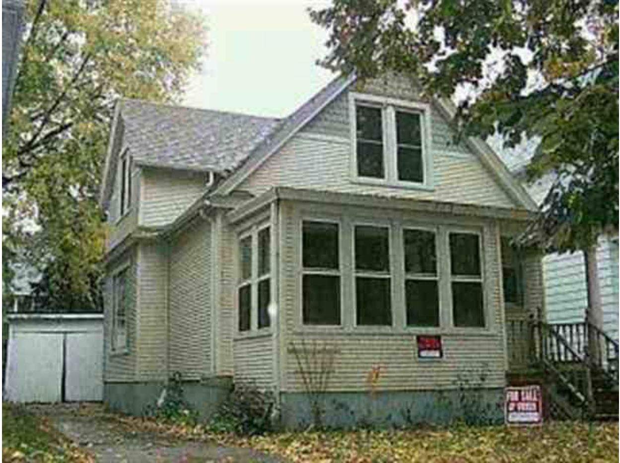
Photo of improvements from October 2001 when current owners listed property for sale.