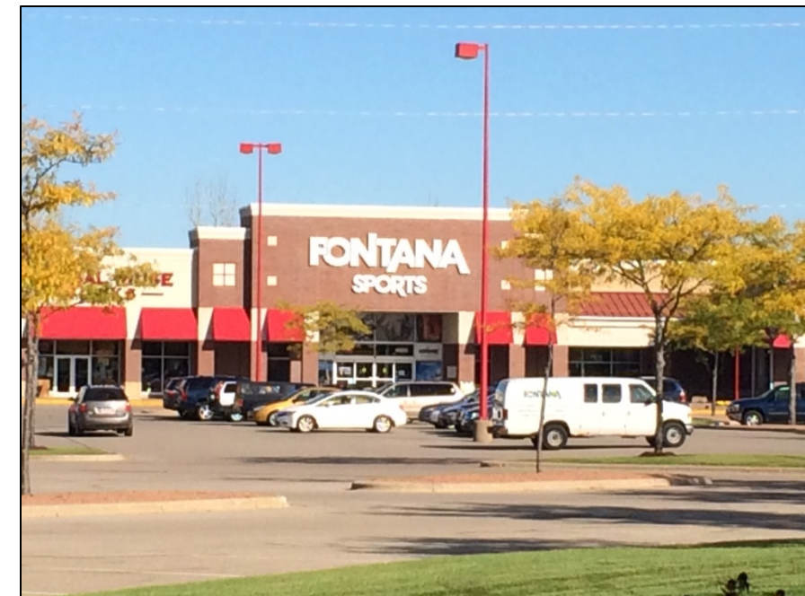
Straight shot – zoomed in