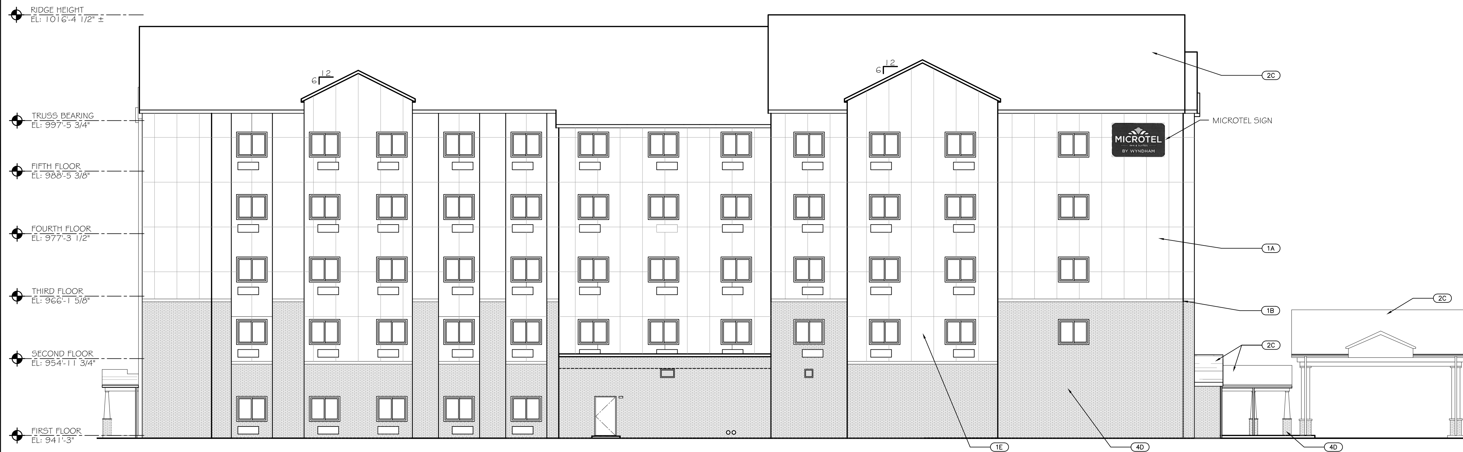
1 SOUTH ELEVATION SCALE: 3/32"=1'-0"