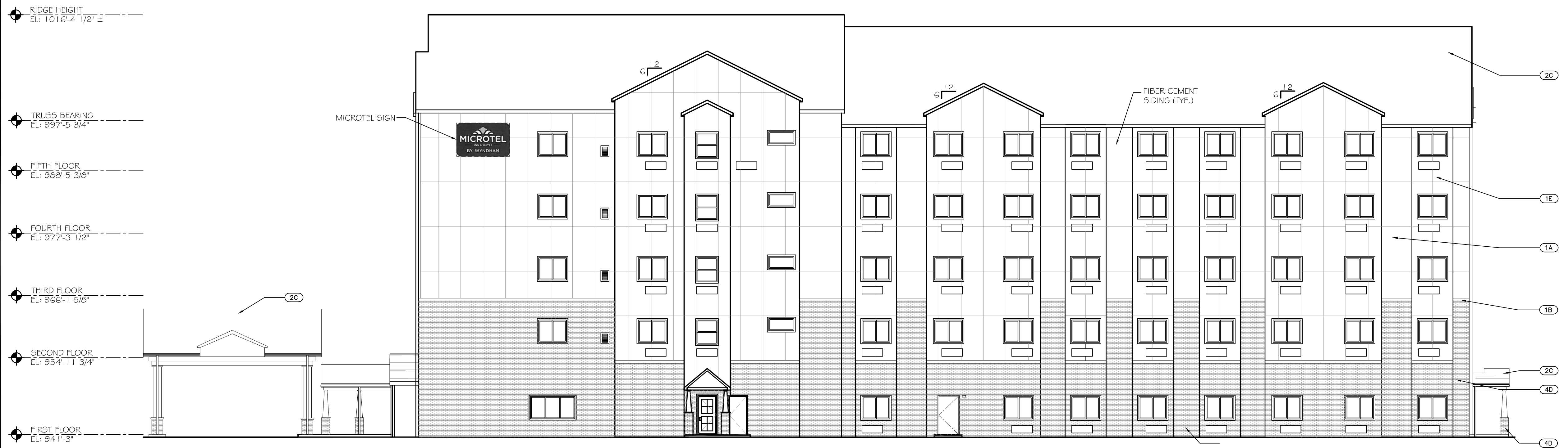
1 NORTH ELEVATION A-11 SCALE: 3/32"=1'-0"