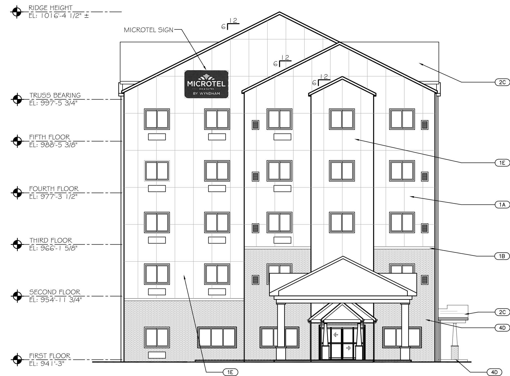
3 EAST ELEVATION w/ PORTE COCHERE A-11 SCALE: 3/32"=1'-0"