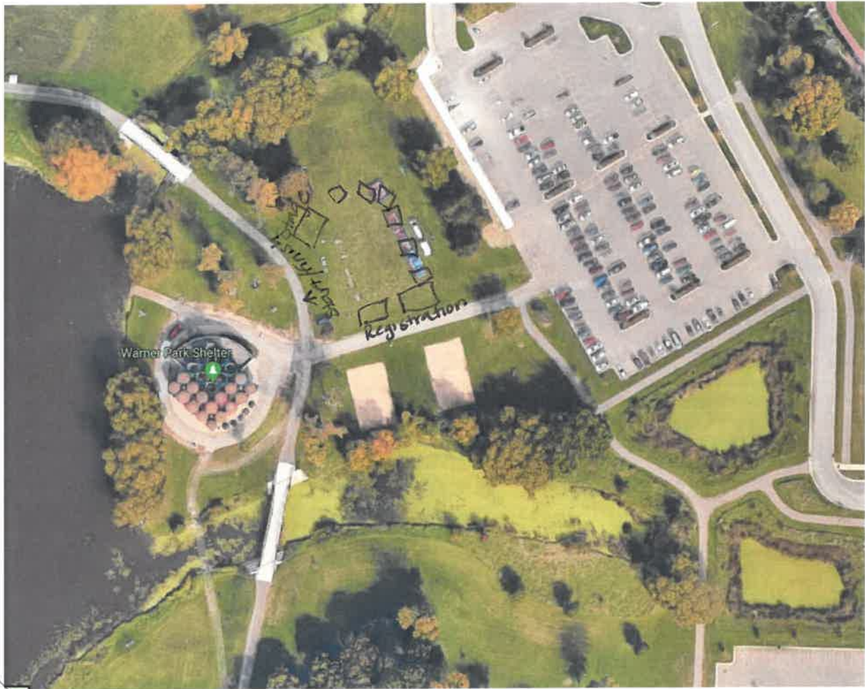
Close up of Warner Shelter Area

The path leading from the parking lot to the shelter is good for vendors to set up along. Or the grassy area between the parking lot and shelter is fine also, if there's not too much rain.