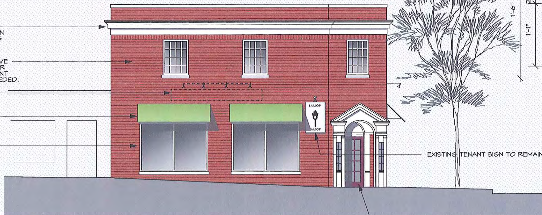
ALLEN STREET ELEVATION SCALE: 1/8" = 1'-0"

REMOVE EXISTING GLASS & INSTALL NEW 1" INSULATED GLASS. (TYPICAL)