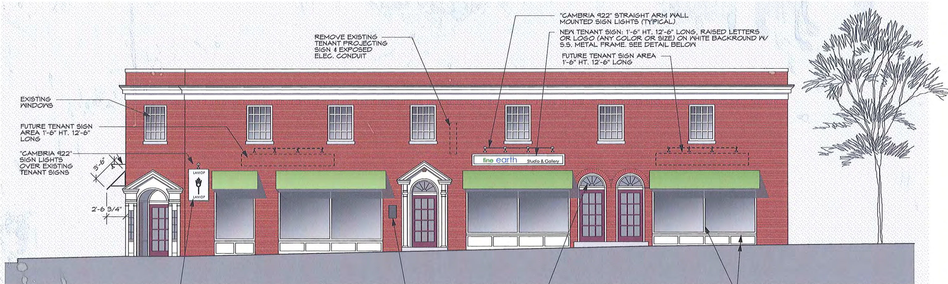
REGENT STREET ELEVATION SCALE: 1/8" = 1'-0"

EXISTING STAINLESS STEEL TENANT SIGN W/ PAINTED LETTERS TO REMAIN. SIGN WILL BE REMOVED WHEN FUTURE TENANT USES SIGN AREAS ABOVE AWNINGS