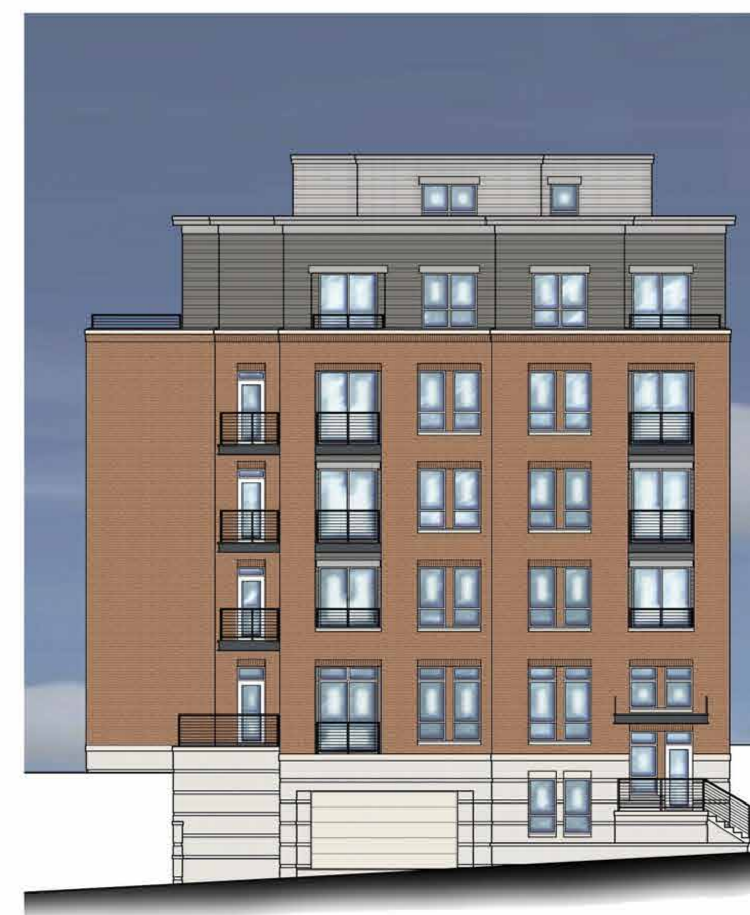
2 MIFFLIN ST ELEVATION A-2.1 SCALE: 1/8"=1'-0"