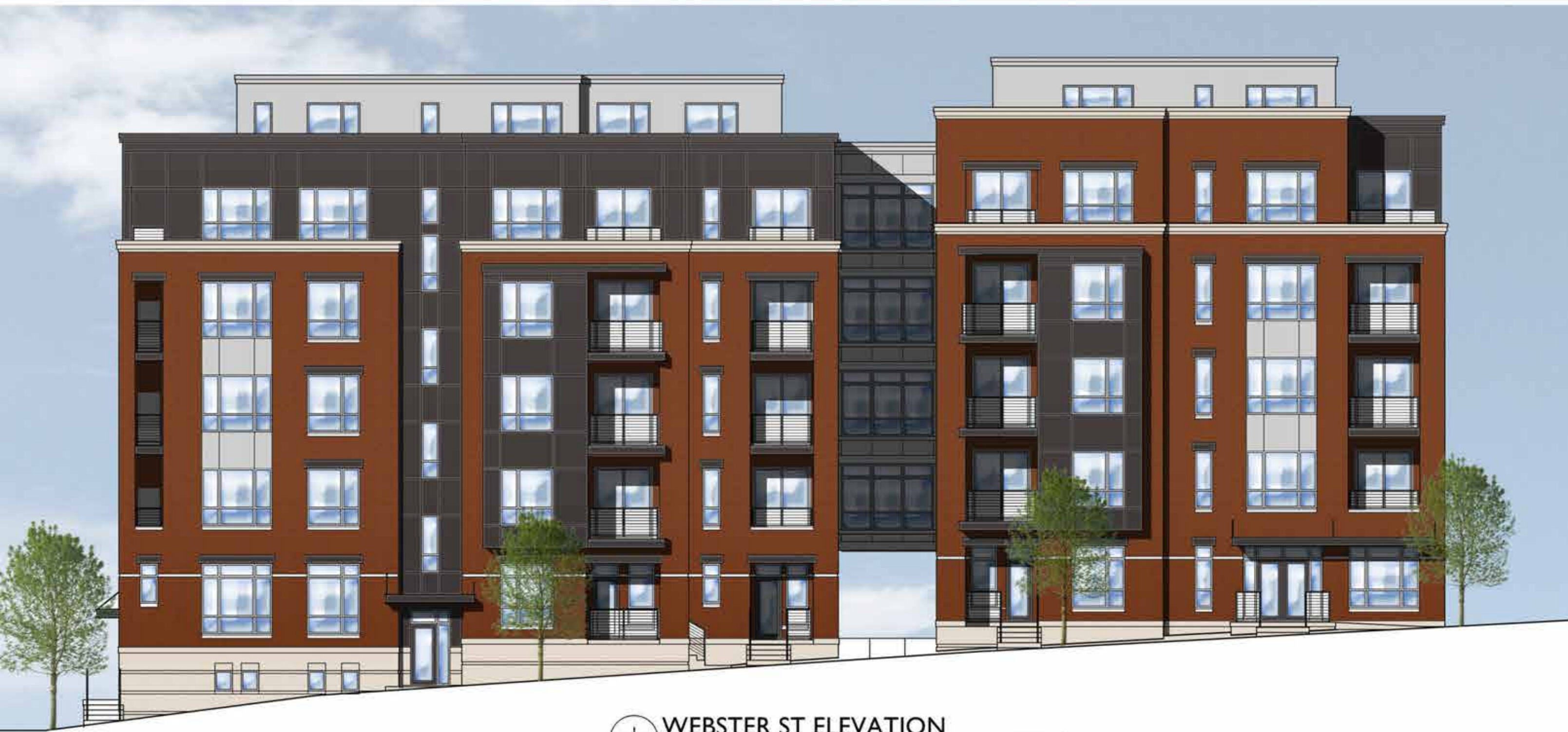
1 WEBSTER ST ELEVATION A-2.1 SCALE: 1/8"=1'-0"