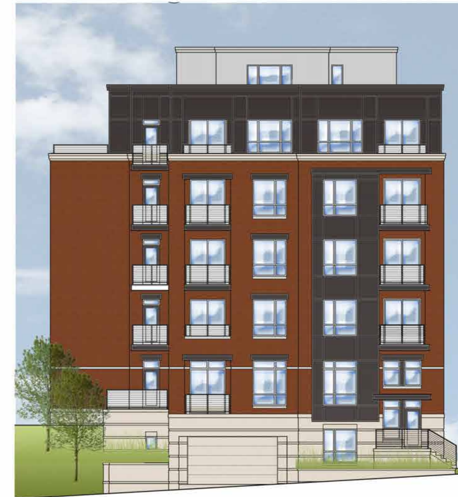
2 MIFFLIN ST ELEVATION A-2.1 SCALE: 1/8"=1'-0"