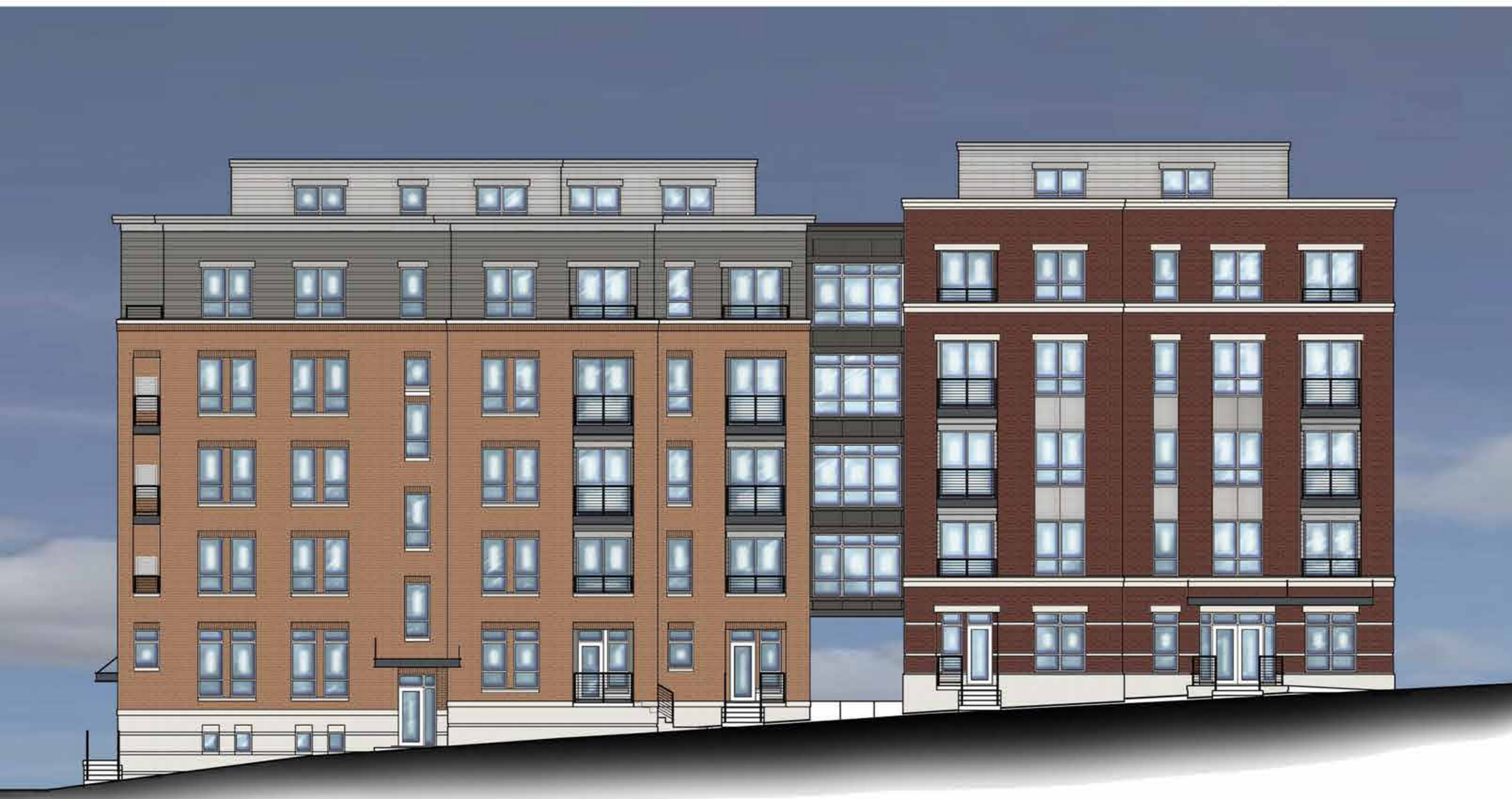
1 WEBSTER ST ELEVATION A-2.1 SCALE: 1/8"=1'-0"